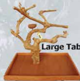
Large Table Top