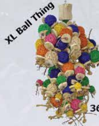
XL Ball Thing