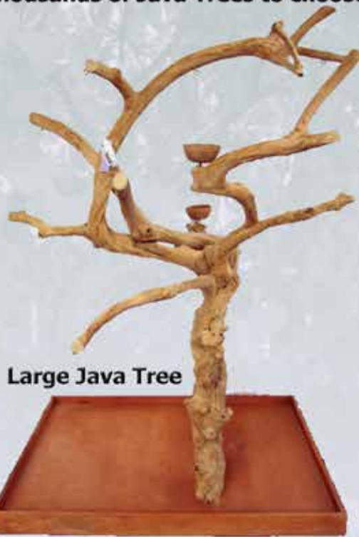
Large Java Tree