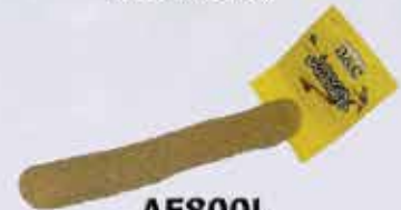
AE800L Sand Coated Perches