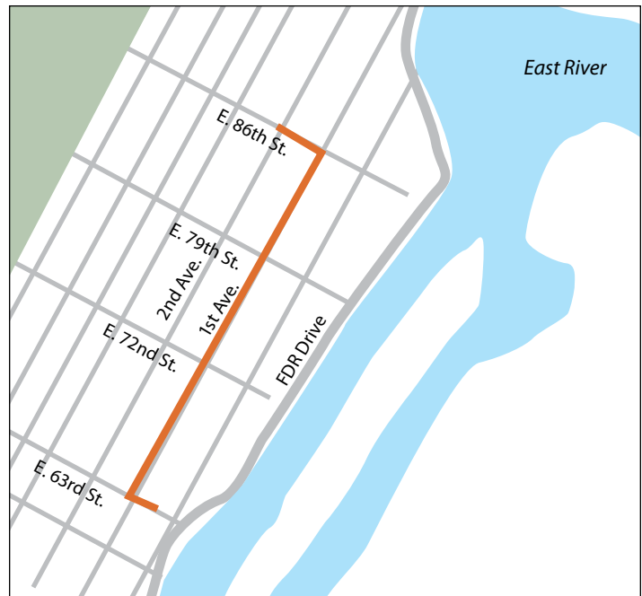
Path of Margie, the missing Golden Conure, in August of 1954, beginning on E. 63rd St. and ending up on E. 86th St.