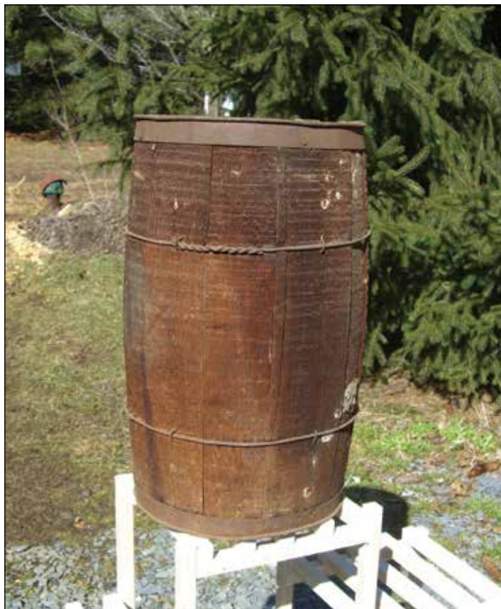
Antique Nail Barrel

So one might ask, if a couple owned such a rare pair of conures, why would they house them in a nail barrel, leave them alone for a weekend with the rest of the menagerie, and with an