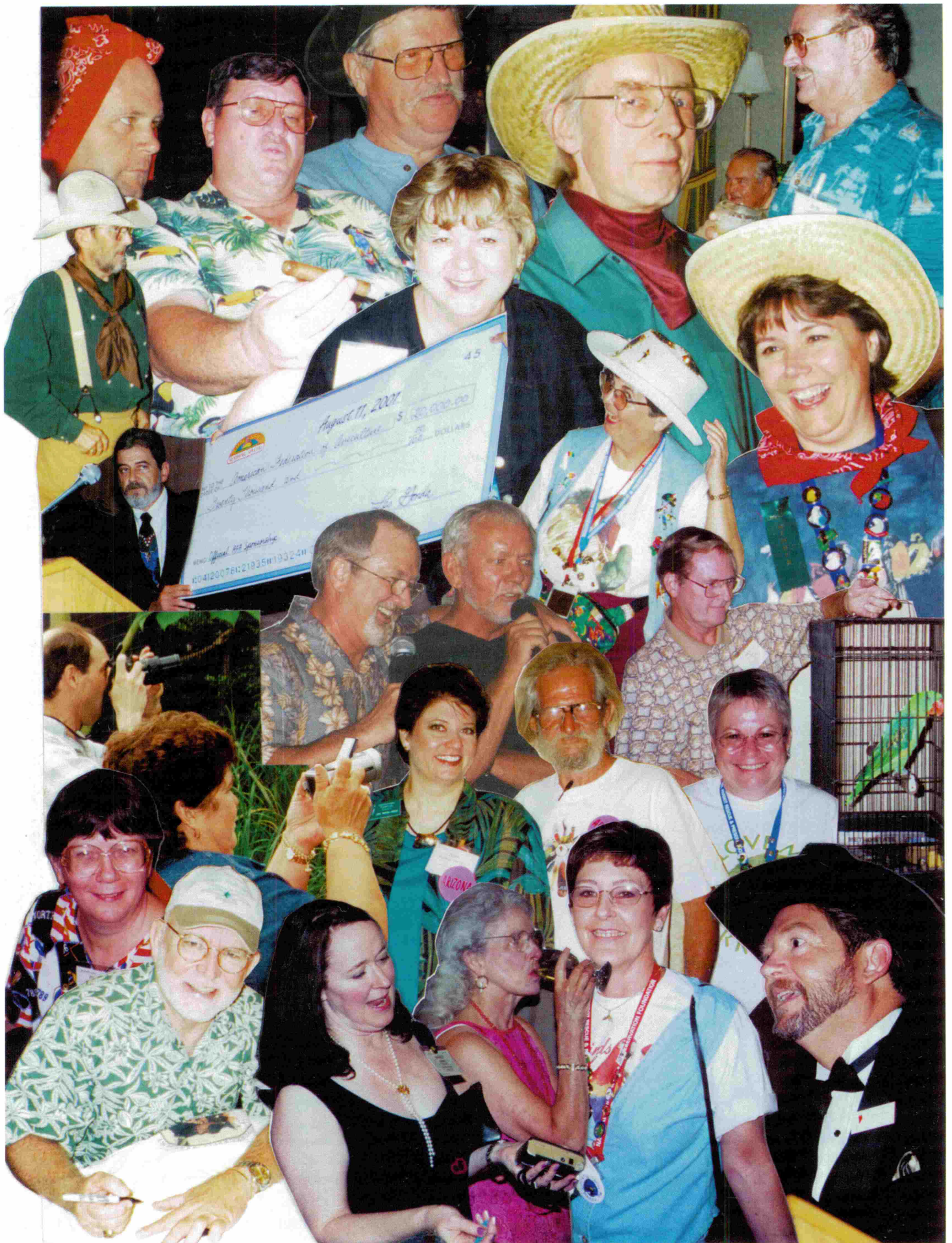
Convention 2001 collage by M.J.Hessler and S. L. Dingle.