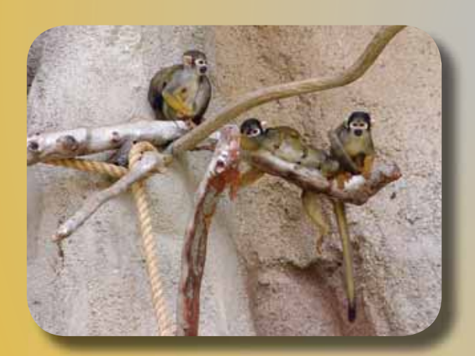
Squirrel Monkeys in the Manu Encounter exhibit at Parrot Jungle Island.

his year's convention was held in Miami, Florida. This was the first time the AFA had been to Miami in 14 years. For the majority of the attendees, the convention officially started on the August 4, 2005; however, there are a number of activities that occur prior to and after the actual convention. Additionally, Miami offered several off site attractions to our attendees.