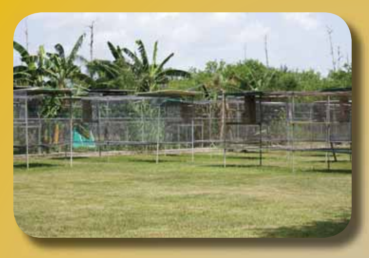
A view of the spacious free-standing flights at Last Chance Farm