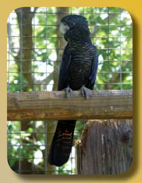
Female Red-tailed Black Cockatoo. There were quite a number of black cockatoos at Last Chance Farms - photo by Matt Schmit

Following the House of Delegates meeting, over 180 attendees met in the hotel lobby and anxiously waited to board one of three busses destined for Last Chance Farms. After quickly loading the busses, many passed the time making new friends and speaking with old friends that had not been seen since the 2004 convention. There was a slight detour as the busses made a few wrong turns on the way to Last Chance Farms, but the camaraderie among the members made this