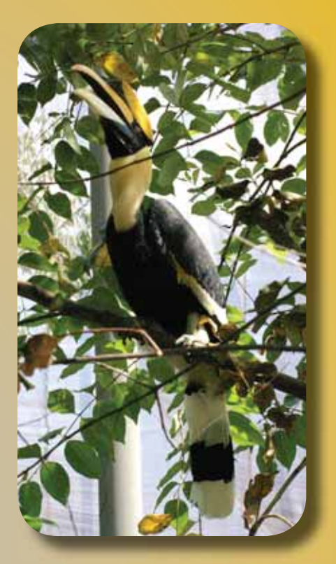
Great Indian Hornbill at Miami Metro Zoo

Parrot Jungle Island was just across the McAurthur causeway from our convention hotel, making it very easy for the convention attendees to visit. Plus, as convention attendees we all received discounted admittance to Parrot Jungle Island, what a treat! Many people who had been to the original Parrot Jungle had expressed that they were apprehensive about going to Parrot Jungle Island because they felt that they would miss the nostalgic "old Florida roadside attraction" appeal. However, the new and improved Parrot Jungle Island did not disappoint. The majority of the parrot collection was housed in spacious flight cages with privacy areas for the birds to retreat to and get away from the public. At the front entrance and along the pathways there were macaws and cockatoos on open perches allowing visitors and chance for an up close interaction with the birds. In addition to the parrots, Parrot Jungle Island also maintains a collection of reptiles, primates and big cats and has three amazing shows that are enjoyable as well as educational.