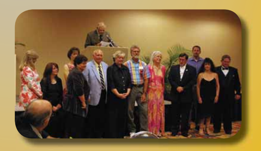
New and returning board members take the oath of office.