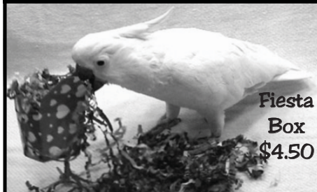
Fiesta Box $4.50

Fiesta Munch $3.00 (L) $1.50 (S) Hanging $4.50