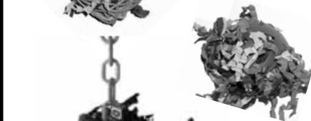
Fiesta Frenzy $9.75