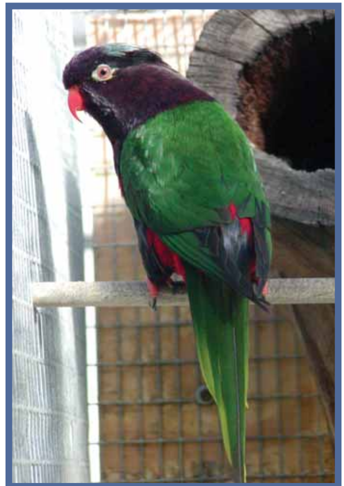
Melanistic male Stella's Lorikeet

Stella's Lorikeets start mating early in January in Southern California. After mating, two eggs are laid about a week later. The eggs are laid three days apart. Both parents share in the incubation of the