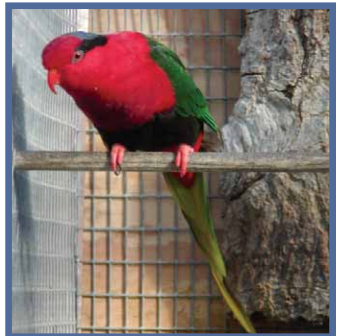
Red Stella's Lorikeet.

The diet of these birds is mostly nectar with some fruit and vitamins. I know some people feed their lorries a pellet and powder diet that the birds mix with water. This is fine for the larger lorries, but Charmosyna