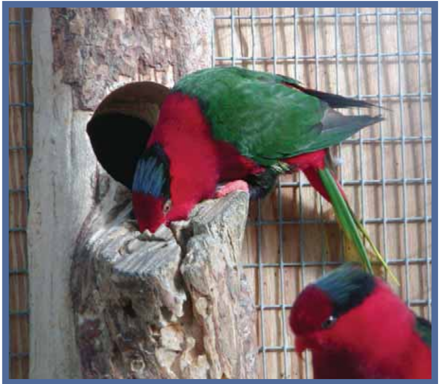
Red Stella's on the oak tree nest front.

After the babies hatch we do not change the shavings for ten days. The shavings are changed about once a week for the next three weeks, and then twice a week until the babies fledge. The parent's reaction to my intrusions into their nest box is very interesting. Most of the pairs just leave the nest box when I scratch my fingers on the outside of the box. Some parents sit on the babies even after I lift up the lid to change the shavings. I have to push them off the babies with my hands. There are a few males that will bite my fingers if I reach in the box. When this happens, I stuff a pair of socks rolled into a ball, into the ramp. There was one very aggressive male that refused to leave the babies even after I pushed him off, and he would bite. So I waited to change the shavings when his mate was the in the box, because she would leave without any problem. The aggressive male would make a run back into the box before I could stuff the sock into the ramp. Finally, I used a hand held mirror. He would fight with the image in the mirror. I held the mirror against the side of the cage with my left hand and removed the babies and changed the wet shavings with my right hand.