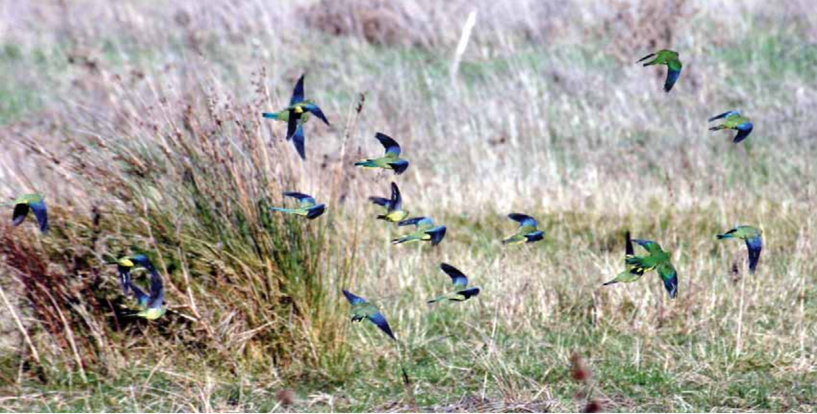
A flock of Blue-winged Parrots.

roosts in densely-foliaged bushes or low trees, and in late winter these roosts are abandoned as pairs disperse to breeding territories. During the breeding season, from August to December, all-male groups of up to six birds commonly are seen, but at other times most sightings are of pairs or family parties. They are quiet, unobtrusive birds, spending much of the day feeding on the ground, usually in the shade of a tree or within 30m of the forest edge if in open grassland. They are tame, merely walking away from an observer or fluttering a short distance to realight on the ground. When coming to drink, they approach cautiously, pausing in a nearby tree before dropping to the ground, running to the water's edge, and departing immediately. The nest is in a hollow in the trunk of a small tree or in a hole in a stump, fencepost or log lying on the ground, and pairs have accepted artificial nestboxes placed in trees or attached to fenceposts.