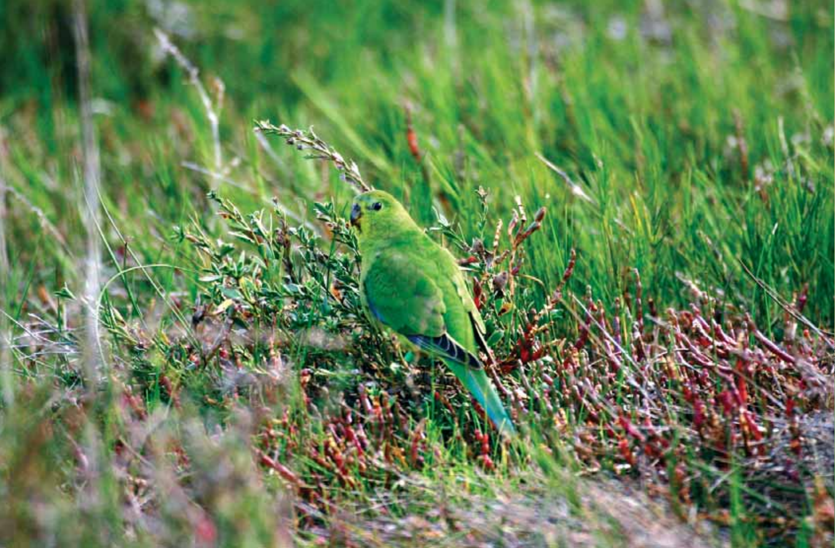
An Orange-bellied Parrot.

they can be recognised by pale blue on the face and the meagre blue wing markings. They are stocky, plump birds, lacking the slim, graceful appearance of both the Blue-winged and Elegant Parakeets. During the breeding season, from August to December, many pairs may congregate to nest on favourite islands, regularly making daily flights of up to 20km over the open sea to mainland feeding sites, but at other times pairs or small parties usually are seen. They are inconspicuous while foraging for seeds among low bushes or long grass and may be overlooked until flushed into the air. When feeding, they are tame, and will allow a close approach. While a strong, blustery wind is blowing, these parakeets are reluctant to leave the shelter of rocks or low bushes and when disturbed merely fly a short distance, always staying low to the ground. However, on a still day, they will rise up and circle high overhead, calling intermittently, then alight on the tops of distant rocks or bushes. On Figure of Eight Island, in the Recherche Archipelago, southwestern Western Australia, I found large numbers of Rock Parakeets sheltering under intertidal