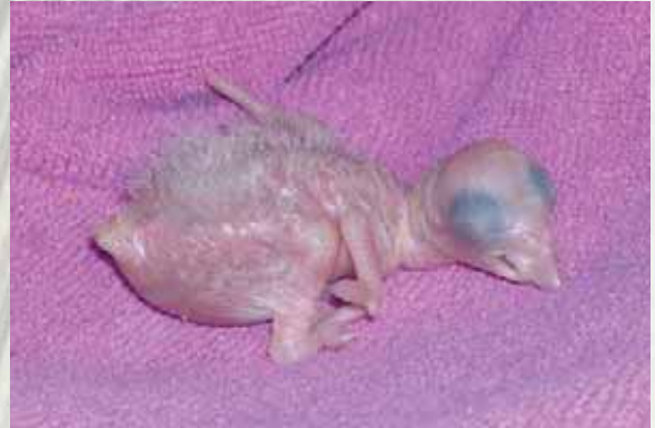
This is the first Blue-cheeked Amazon that hatched in the United States. This photograph was taken when the chick was one day old

Eventually, in late 2005, some breeding cages adequate for amazons were available and two pairs of Blue-cheeked Amazons were moved to these cages. Pairs were chosen at random with out any regard to behavior, color or temperament. The winter of 2005