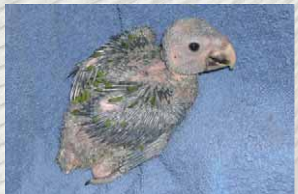
35 days old