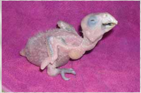
21 days old