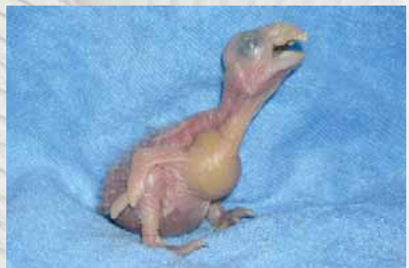
2 weeks old