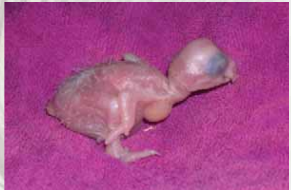
The chick at 7 days old