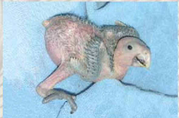
4 weeks old