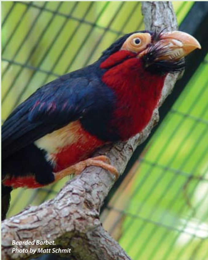
Bearded Barbet.

Some say the Mockingbird ( Mimus polyglottus ) is the best songster in the world. Others swear by the Nightingale ( Lucinia megarhynchus ). But in the world of American aviculture, arguably the best songbird available is the Shama Thrush ( Copsychus malabarica ). The male's song is loud, brash and intricate. The female's is demure, soft and sometimes hard to hear. Originally from Southeast Asia, the birds are taken by their owners to parks in Asia (and in the US now, too) for song competitions. Their diet is the standard softbill diet of fruit and pellets with live food such as crickets and mealworms available all year round and waxworms during the breeding season. The males can be very aggressive toward new mates, though birds that have been raised together since they were young seldom have problems. They will breed fairly readily in an English Budgie box or a gourd but, although many chicks fledge, they are not all that easy to raise to adulthood. The male Shama must be removed from his family after the youngsters have been fledged for a couple of weeks; he will be ready to breed again and will kill the chicks. The female will wean them and once they are removed from the flight, he can come back and the hen will be receptive. Shamas are good community aviary birds EXCEPT with Dhyal ( C. saularis ) thrushes, Fairy Bluebirds ( Irena puella ) and other intense singers.