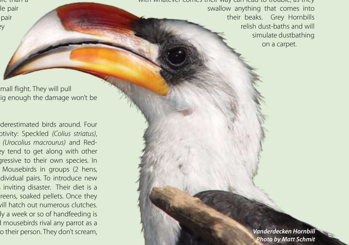
Vanderdecken Hornbill

Toucans and hornbills need relatively more space than a comparably-sized parrot. They don't use their beaks and feet for climbing and fly-hop from perch to perch. They make affectionate pets and, as long as the cage size is suitable, can be kept in the house as a family pet. They are intensely curious, bright birds and their propensity for playing with whatever comes their way can lead to trouble, as they swallow anything that comes into their beaks. Grey Hornbills relish dust-baths and will simulate dustbathing on a carpet.