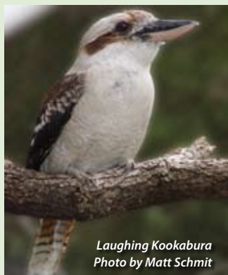
Laughing Kookabura