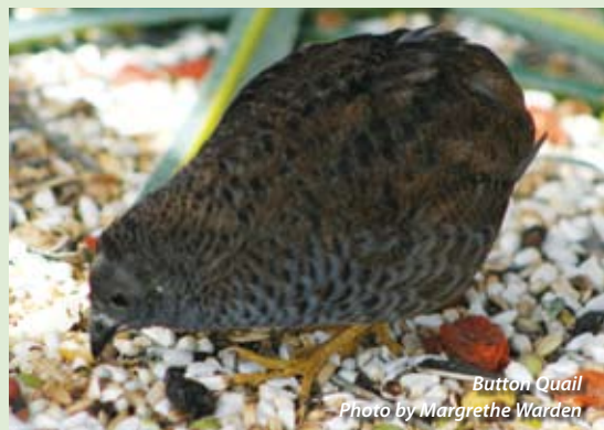
Button Quail