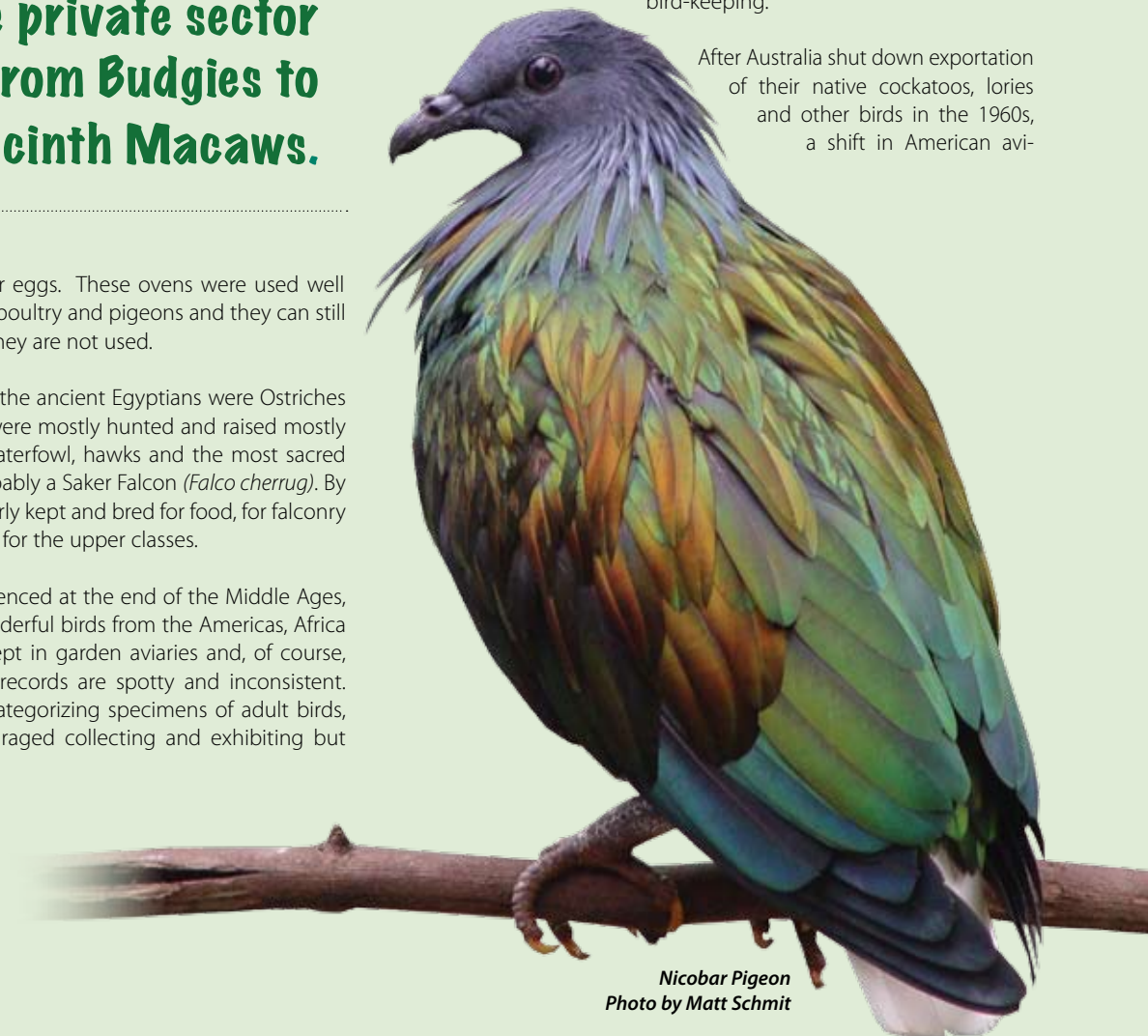
Nicobar Pigeon

After Australia shut down exportation of their native cockatoos, lorries and other birds in the 1960s, a shift in American avi-