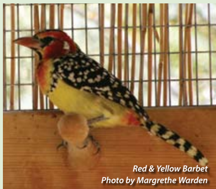
Red & Yellow Barbet