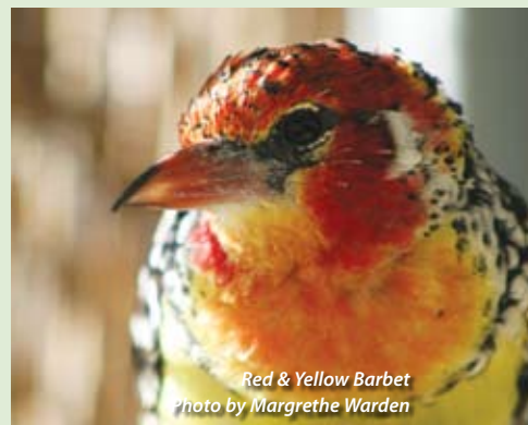
Red & Yellow Barbet