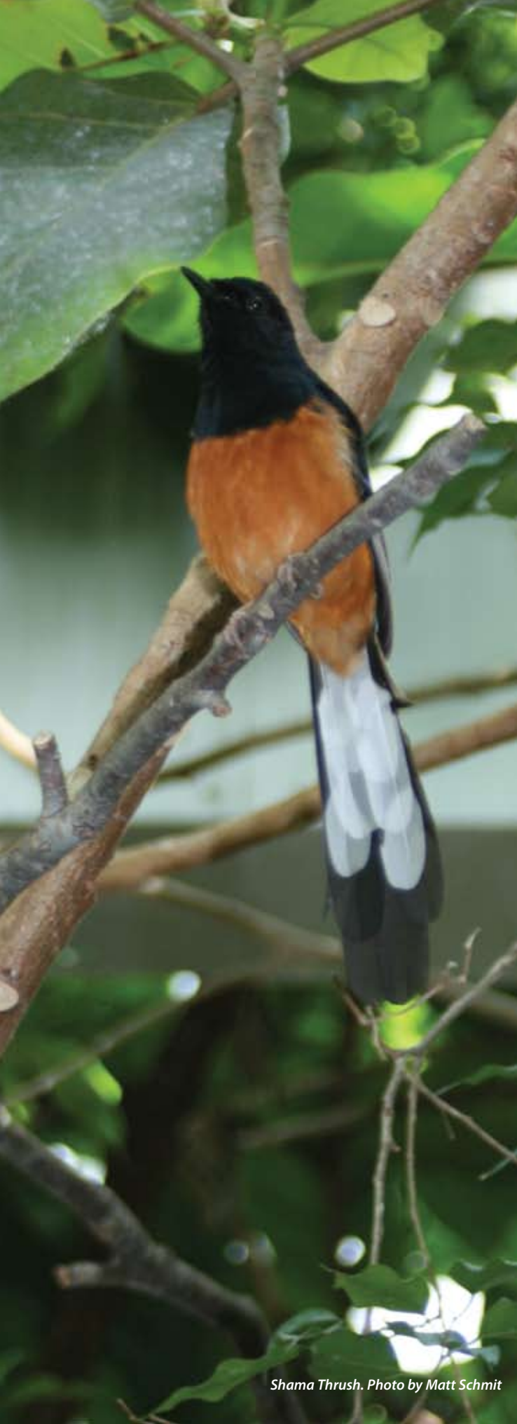
Shama Thrush.