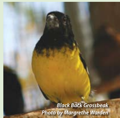
Black Back Grossbeak