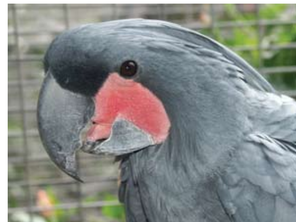
Breeding female Palm Cockatoo ( Probosciger aterrimus )

From the 31st of December 2007 to the 10th of January 2008 at 5 pm every workday, ten new programme about Loro Parque will be shown in the series "People, Animals and Doctors" on the German TV channel VOX. This is the unique chance for the spectators to gain an insight into the daily work of the biologists and veterinarians with the animals. To date, over 60 programmes of the successful series of Loro Parque and Loro Parque Fundación have already been produced, and as the series is continuing until at least the middle of the year 2008, at least further 20 series from the Loro Parque are planned.