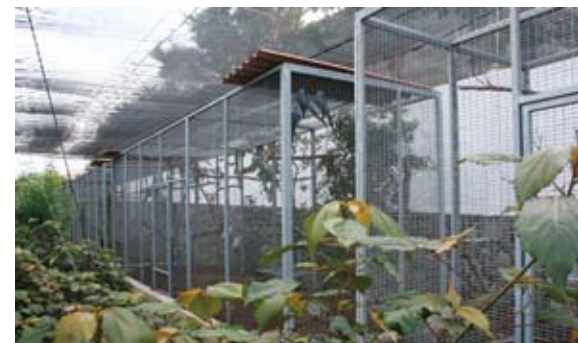
Aviaries for the Spix's Macaws in the new breeding centre of Loro Parque Fundación

( Probosciger aterrimus ) normally opens the breeding season at the beginning of the year, but this time they already started breeding at the end of November, most probably because of the lasting beautiful autumn in Tenerife.