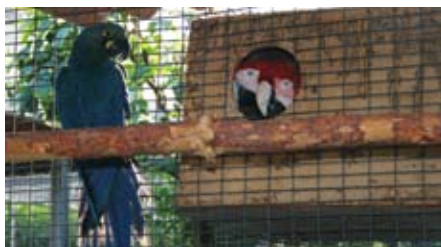
Young Lear's Macaw in its aviary together with its foster parents, a pair of Green-winged Macaws

After a longer breeding pause, we are currently raising two Green Conures ( Aratinga holochlora ). The parents are undertaking their breeding and rearing activities well, so that help has not been necessary.