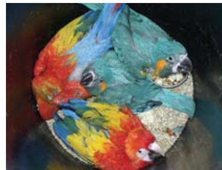
Two Scarlet Macaws ( Ara macao ) and two Blue-throated Macaws ( Ara glaucogularis ) in their breeding bins in the Baby-station of Loro Parque

foster parents, a pair of Green-winged Macaw ( Ara chloroptera ), the third of the youngsters is still being cared for by its own parents in the nesting cavity. The first youngster is already eating by itself, however still begging from his foster parents for an extra portion of food. The second youngster, which fledged some days ago, is flying around but still dependent on the care and the provisioning of its foster parents. Despite of the different plumage colour of the young Lear's Macaws, the Green-winged Macaws accept their youngsters without any hesitation. Until now, the third youngster didn't show at the entrance to the box. However, we are expecting him to fledge during the next few days, leaving the nesting cavity for the first time.