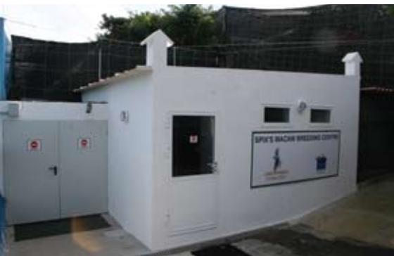
Entrance to the new breeding centre for Spix's Macaws of Loro Parque Fundación

This has been a symbolic month of the 35th anniversary of Loro Parque. On the 17th of December 1972 Loro Parque opened its gates for the first time. In those days it only had an area of 13,000 m 2 , and only showed parrots. From the original purely parrot park, today's Loro Parque with its 135,000 m 2 , is one of Europe's leading zoos and a principal magnet for tourism in the Canary Islands, now having received 34 million visitors.