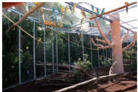
View into the new huge aviary of Ara glaucogularis in Loro Parque

the little Palm Cockatoo had opened its eyes, attentively observing its surroundings. Another fertile Palm Cockatoo's egg is at the moment developing in the incubator.