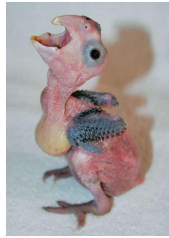
18 day-old chick of Palm Cockatoo (Probosciger aterrimus)

hand-rearing and diseases. Furthermore the participants will have the unique opportunity to have a look behind the scenes of Loro Parque and to ask questions to which one always wanted to know the answer. More information at: arndtverlag@aol.com.