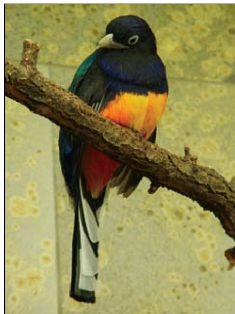
The male of a breeding pair of White-tailed Trogons ( Trogon viridis ) at Zoo Wuppertal