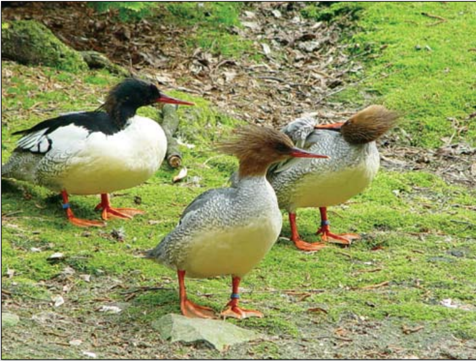
Chinese Mergansers ( Mergus squamatus ) at Zoo Wuppertal