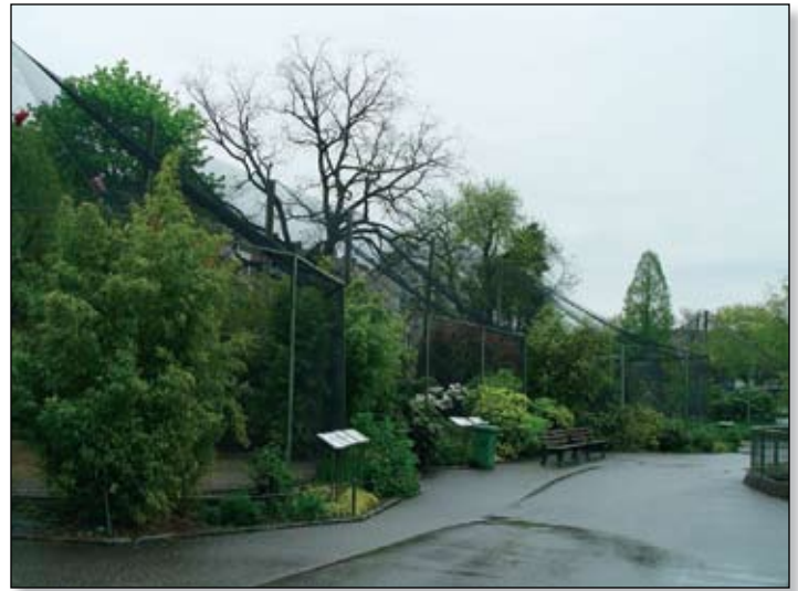
Cologne Zoo's Pheasantry

Among other birds displayed in aviaries through out