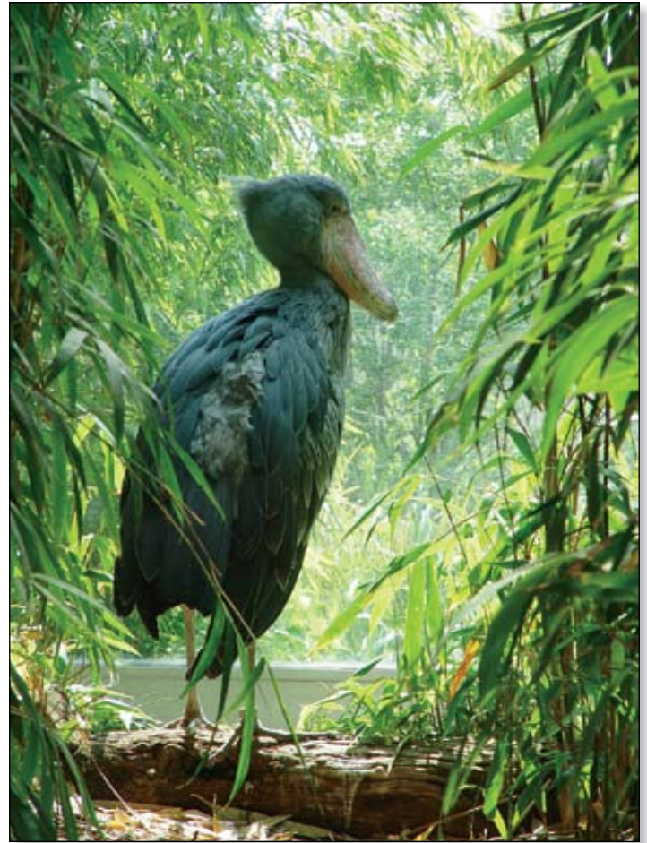
Shoebill ( Balaeniceps rex ) at Frankfurt Zoo

Although Red-whiskered Bulbuls have long been a traditional aviary bird, Frankfurt's flock of forty or so, in its famous free flight hall, is especially remarkable in that this species has bred almost continually there since 1964! This is especially significant in that a ban on the commercial importation of birds to member countries of the European Union has been in effect since