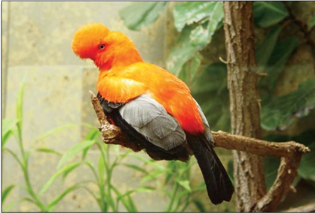
Male Andean Cock of the Rock ( Rupicola peruviana ) at Zoo Wuppertal