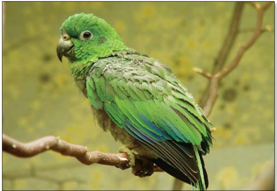
The Black-billed Amazon ( Amazona agilis ) is one of Jamaica's two Amazon species. Zoo Wuppertal received confiscated birds, and has since bred this reputedly difficult species.

More than a dozen Barn Swallows now share their marshy aviary with two White Wagtails, a breeding pair of European Lapwings, and a flock of European Avocets that have produced more than 400 offspring. This exhibit is one of several built alongside the bird house, connected to off-exhibit indoor compartments. Other inhabitants of these outdoor aviaries include: The first European Hawfinch I'd seen; Guira Cuckoos kept with