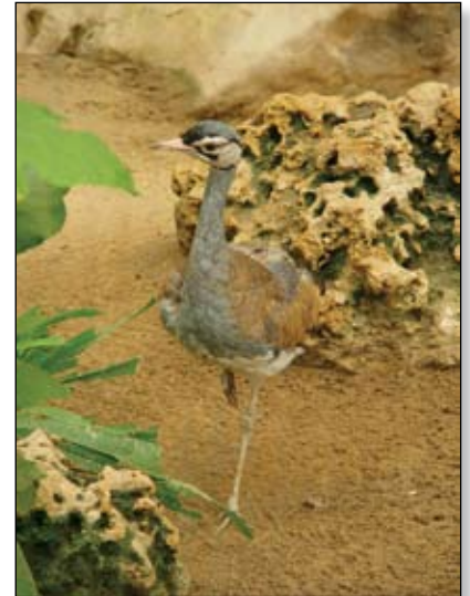
Senegal Bustard ( Eupodotis senegalensis ) at Zoo Krefeld

THE 32-ACRE KREFELD ZOO WAS FOUNDED IN 1938, on the site of a private collection that had existed from 1877 to 1914. It came to international attention when the first Cheetah cubs to survive in captivity were born there in 1960. In avicultural circles, this zoo is renowned for hatching more than 70 Carmine Bee-eaters and distributing them to many other collections (Bernhardt et al , 2007). Krefeld currently maintains around twenty Carmine Bee-eaters in a soaring aviary inside the glass-walled birdhouse, built in 1989. A vast sandy-looking cliff at the back of this exhibit is pocked with bee-eater nests. Other African species in this building include Senegal Bustards, African Pygmy Geese (which have been parent-raised here) and Egyptian Plovers, successfully bred at Krefeld for the first time in captivity (Bernhardt et al , 2007). Among other birds in this building are Superb Fruit Doves (more frequently seen in Europe than in the U.S.), Red-whiskered Bulbuls, White-naped Pheasant Pigeons, and Toco Toucans.