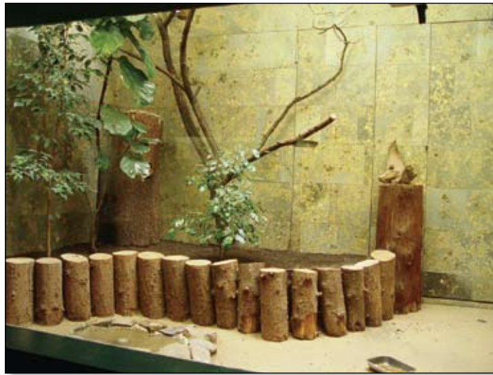
Exhibits in Zoo Wuppertal's bird house have unique stone backgrounds.

for native minnows. In the entry hall, the South American River was the first split-level aquarium to feature tropical fishes and birds together in one environment. Brazilian Scarlet Tanagers and Wattled Jacanas live there now, above an assortment of cichlids, characins, and turtles. At my visit, Jacanas hand-reared from eggs laid in this exhibit were displayed in the zoo's brooder room. On the other side of the entry hall is a large exhibit for Gentoo Penguins.