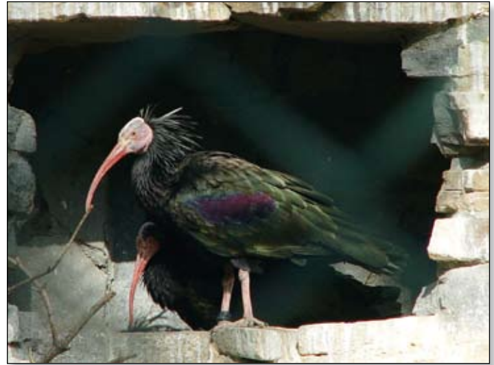
Waldrapps ( Geronticus eremita ) at Zoo Duisburg

Wuppertal does not have as extensive off-exhibit bird breeding facilities as some other zoos, but some choice species are kept off-display. Red-browed Amazons ( Amazona dufresniana rhodocorytha ) are maintained in what was formerly the Max Planck