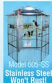
Model 605-SS Stainless Steel Won't Rust!

View a huge selection of cages, supplies and accessories at kingscages.com