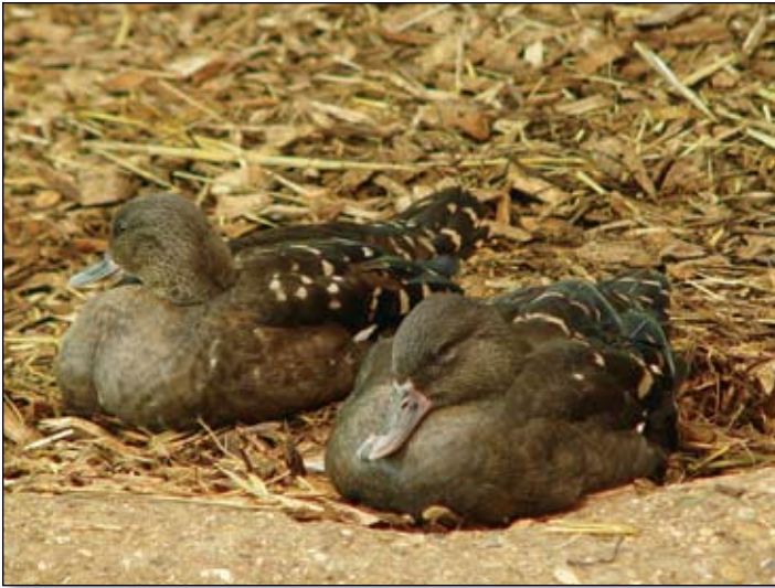
African Black Ducks ( Anas sparsa ) at Zoo Duisburg

Spectacled Eider, and some equally rare King Eiders. I was especially surprised to see a long-time captive Black Scoter, as well as Harlequin Ducks and Long-tailed Ducks (or Old Squaws). The Baer's Pochard, from northeastern Asia, was a species I had not seen in more than twenty years.