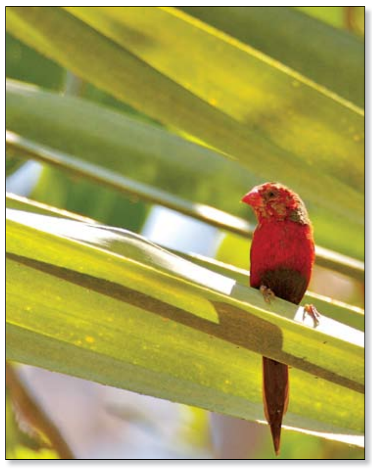
A juvenile Crimson Finch is on the lookout in a Pandanus Palm.