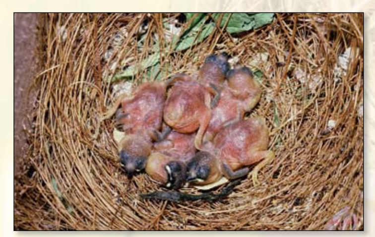
Crimson Finch nestlings