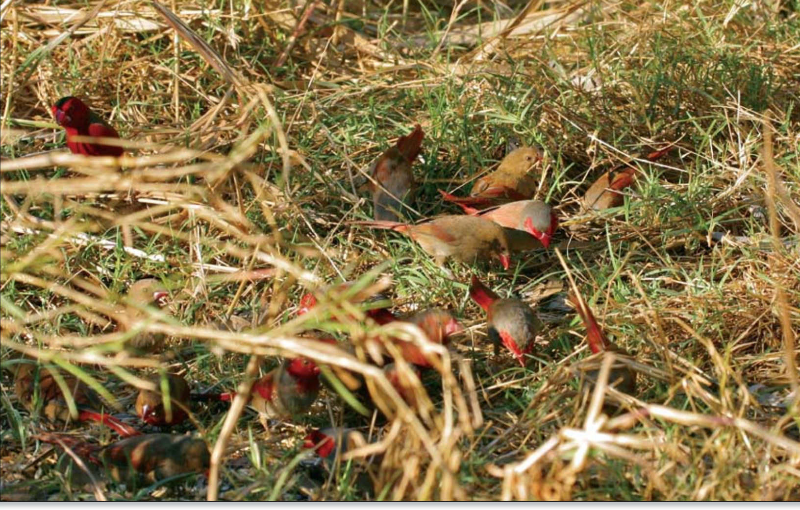
A group of foraging Crimson Finches