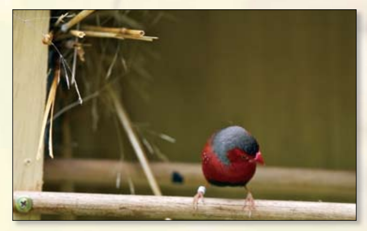
Male Crimson Finch guarding his nesting female.

wide aviary. And the result? The cocks quickly sorted out who was boss and paired up with the hen. During one season they produced 23 juveniles before I broke the group up.