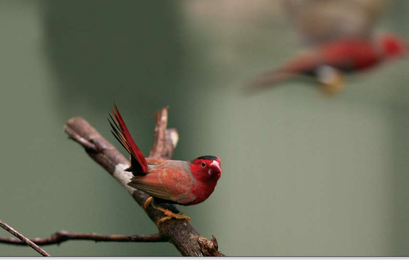
Crimson Finch aggression display

cock would not approach a beta male from below because that is the submissive position which would make the beta male dominant. Just watch the birds in your aviaries. If a dominant cock lands on the same level as another, he will either raise himself up or fluff up part of his body so that he looks bigger than the other guy. Therefore, it is important when moving birds into a new colony to put them all in at the same time. Then, over the next three days or so, they will sort out their pecking order. If you introduce a new bird (or birds) into an established aviary, the whole colony will turn on the stranger before they get the chance to find food or water. This is why people will often complain they lost a new bird within the first few days of purchase and introducing it into their aviary.