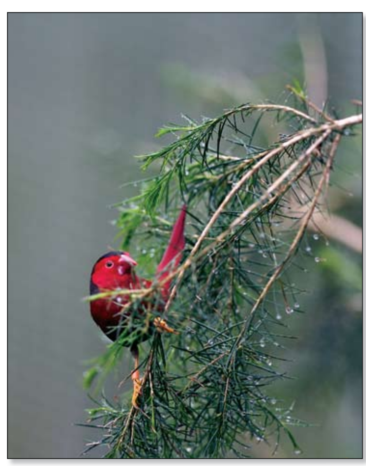
Crimson Finch perched during the wet season.