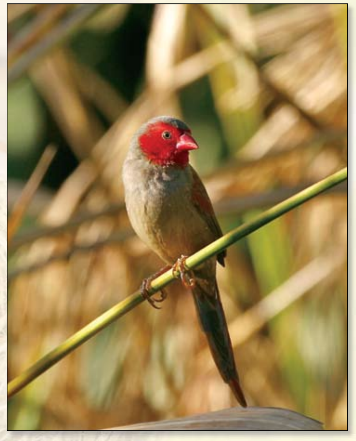
Crimson Finch female

When I discussed this with an American scientist who was doing the Crimson work, she confirmed my findings and explained the behaviour was standard "mate protection". Each male would protect his female from extra pair copulation or, in other words,