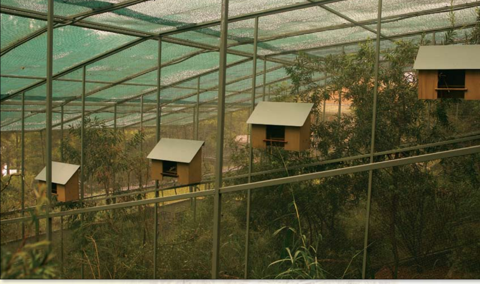
Crimson Finch nesting shelters in descending order.