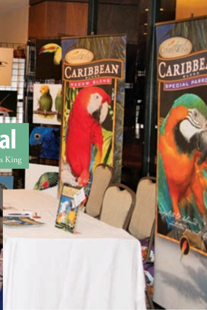
Above: Parrot festival vendor hall.