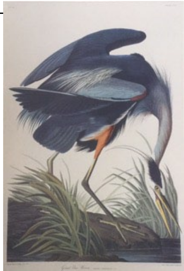
Great Blue Heron from Birds of America by John James Audubon.

Audubon was the first illustrator of birds to include a background showing the bird's typical habitat and treating the background with the same care as he does the subject. Audubon also was known for painting birds in scenes of typical behavior including all manners of "feeding". Editions of Birds of America remain in print to this day and original copies of the double elephant folio fetch high prices on the art market.