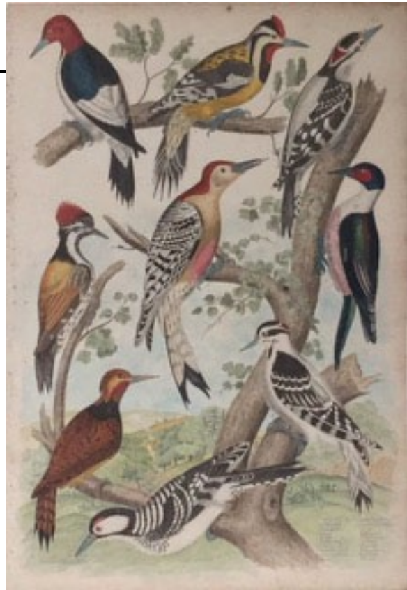
Woodpeckers from The Edinburgh Journal of Natural History and Science by William MacGillivray.

In 1830 he met and developed a close relationship with Audubon who asked him to improve his text describing Birds of America . For the next 10 years, MacGillivray published 13 books and worked with Audubon to produce the 5 volumes of the Ornithological Biography. He also started the Edinburgh Journal of Natural History and the Physical Sciences in 1835 and worked on it until its termination in 1840. The following year he moved back his birthplace to become a Professor of Natural History at Marischel College. MacGillivray is recognized as a gifted artist and is known for combining his artistic flair with creating dramatic design with scientific accuracy in detail.