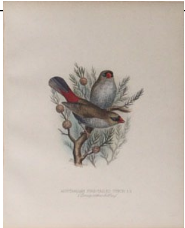
Australian Fire-tailed Finch, illustrated by Frederick W. Frohawk, from Foreign Finches in Captivity by Butler.

The years 1850-1890 were considered the golden age of lithography. After 1890 expensive hand-colored lithographed bird books were on the wane due to the development of faster and cheaper printing techniques, such as chromolithography, and the wider availability of paper stocks. Photographic processes were also being developed and would replace lithography in the twentieth century.