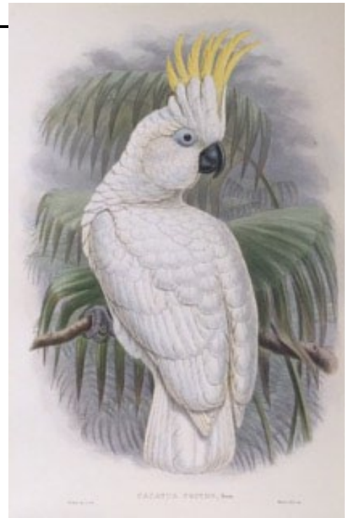
Phailo Laima Aequatorialis Hummingbird from Monograph of Hummingbirds and Cacatua Triton Parrot from Birds of New Guinea by John Gould.

Gould was the son of a foreman in the Royal Gardens of Windsor and became a taxidermist. In 1828 he obtained the position of Creator and Preserver of Birds at the Zoological Society. Several years later he published his first book, A Century of Birds from the Himalaya Mountains that was very successful. As a result, Gould never sought a professional publisher and managed the entire process on his own.