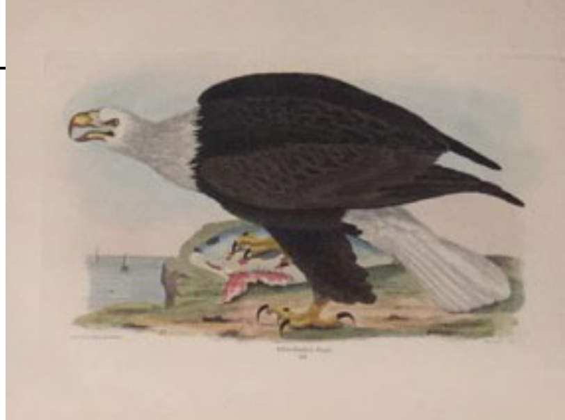
White-headed Eagle from American Ornithology by Alexander Wilson