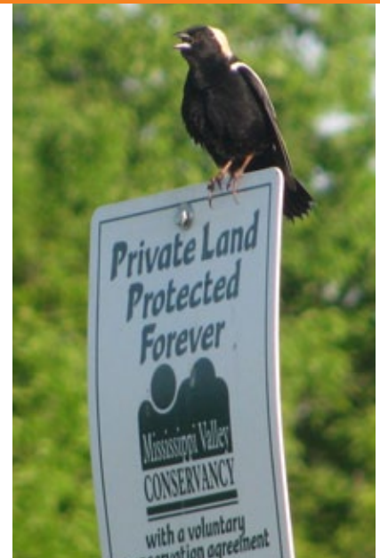
Bobolink on a Mississippi Valley Conservancy sign.

information and funding resources that were gleaned from conservation partners across the United States, and are intended to aid land trusts in strategic bird conservation.