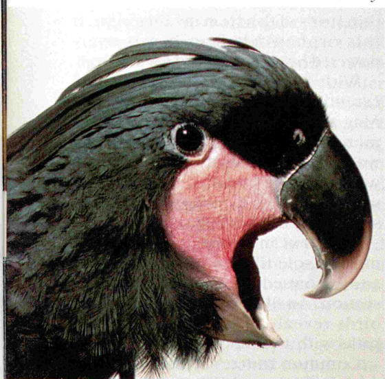
Chick at 90 days.