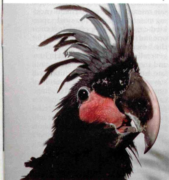
Chick at ten months.