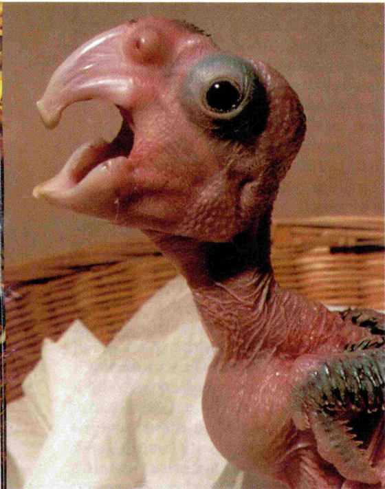
Chick at 25 days.