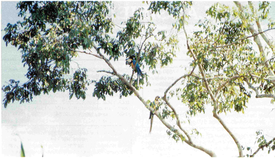
Blue and gold macaws at Cocha Salvadore, Oxbow Lake.