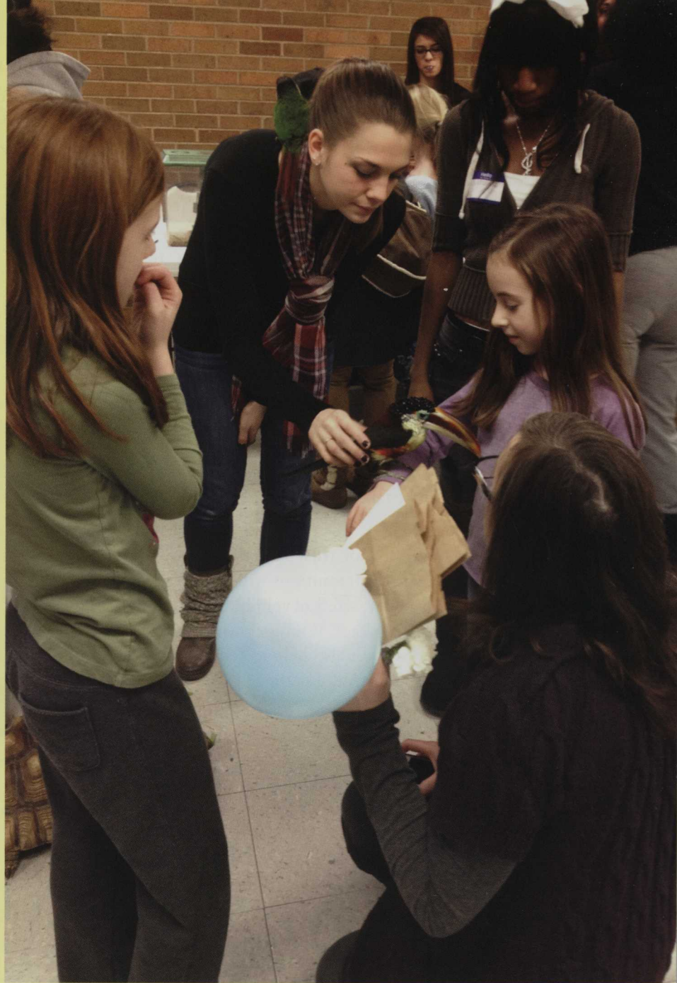
Any age student benefits from interactive programs such as this