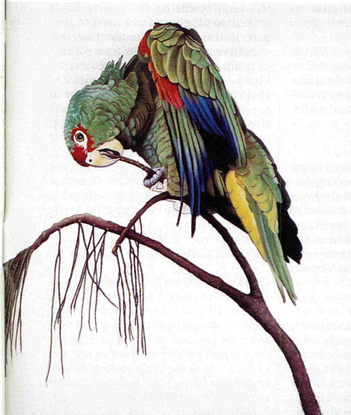
Note the very lifelike pose of this red-spectacled Amazon (Amazona p. pretrei)