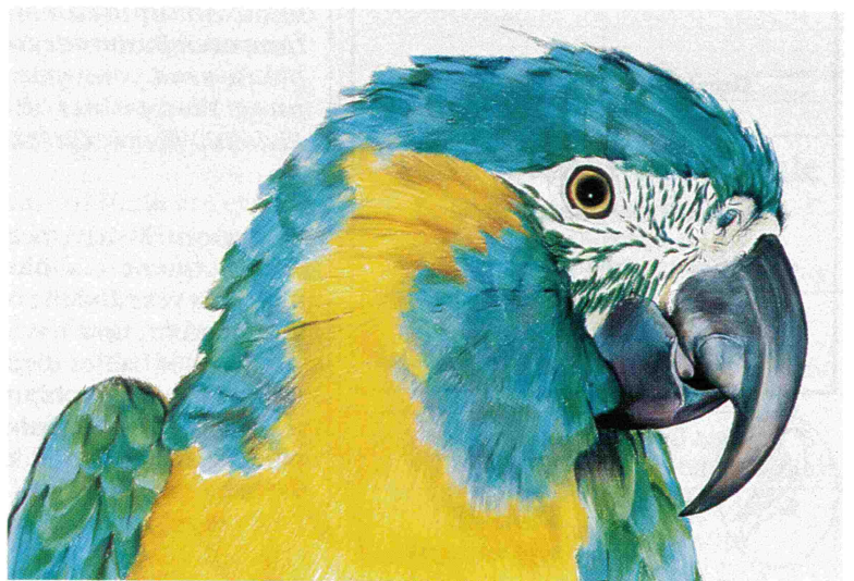
The blue-throated macaw (Ara glaucogularis) is very uncommon in captivity.