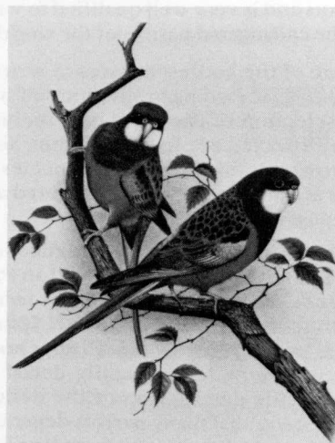
Golden Mantled Rosellas

All 8" x 10" prints, individually signed by the artist, and shipped post paid, ready to frame.