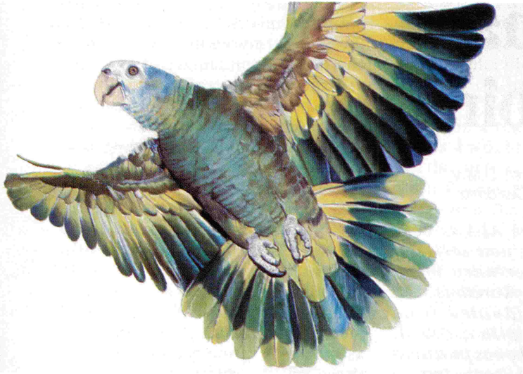
A St. Vincent Amazon (Amazona guildingii) in flight.