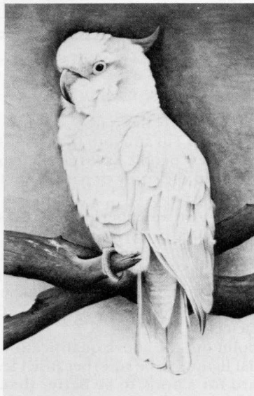
Citron Crested Cockatoo