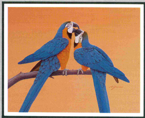
Blue and Coo, 12" x 16" acrylic on acid-free mat board.