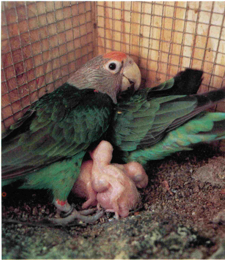
Adult pair of Cape parrots in the box with two chicks a week old.