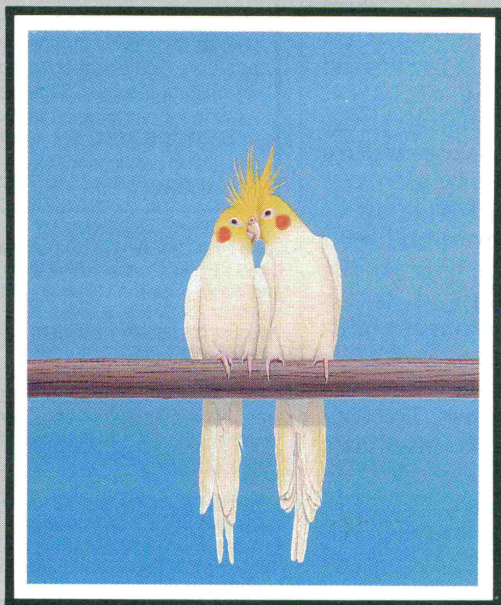
Lutino Love, 16" x 12" acrylic on acid-free mat board.