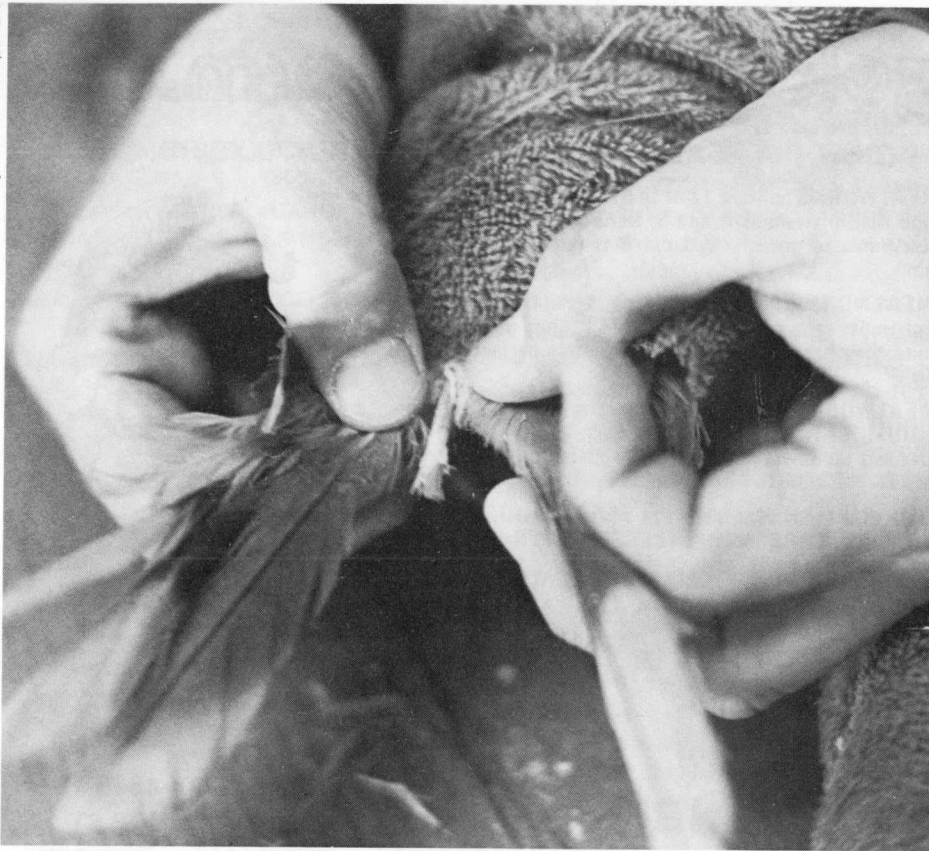
Towel the bird in upright position and find the regenerated blood feathers. Expose the feather for harvesting.