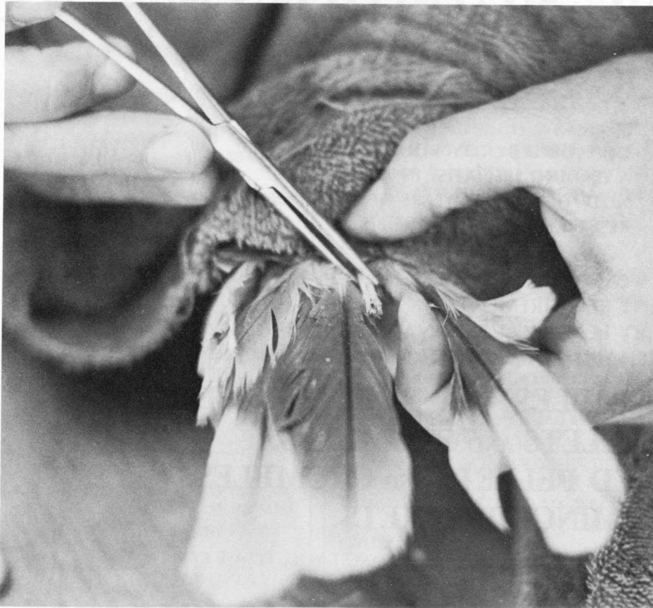
Harvest the feather with a clean instrument.