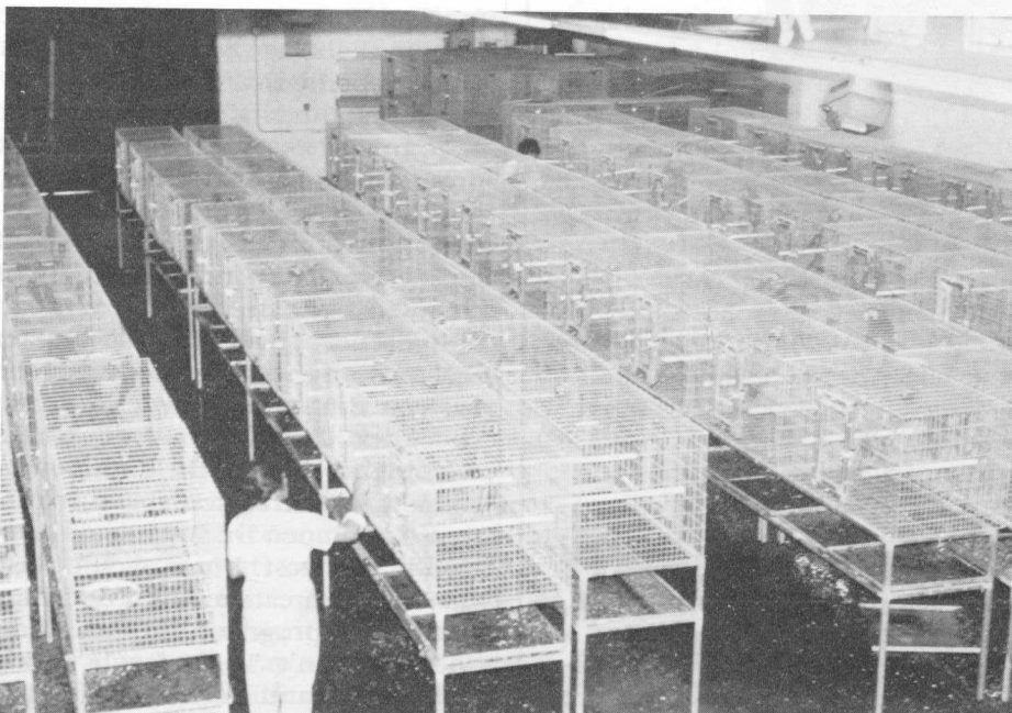
Quarantine import station holding cages. An increasingly rare sight — banks of cages housing singles and pairs of macaws.