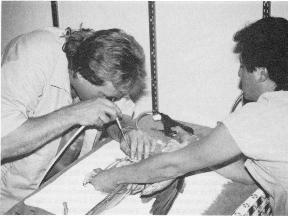
Quick and careful surgical sexing with skilled hands and fiber optic endoscope.