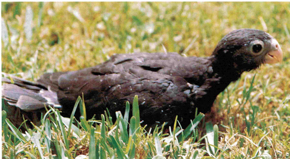
Lesser vasa parrot chick aged 37 days.

pointed out that vasa parrots of both sexes have this ability, unique among parrots, when in breeding condition. I observed this many times in my own pair of greater and was very surprised at the large size of these organs.