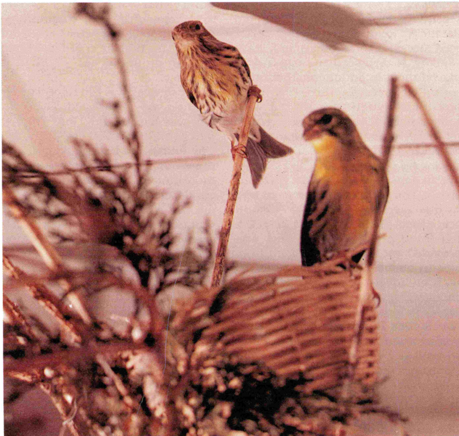
A pair of European serins, the closest relative of the wild canary. The hen can be easily identified by her heavily streaked breast.

babies were lying dead on the floor with apparent beak wounds.