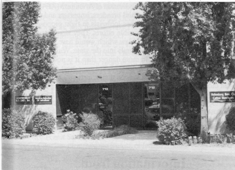
AFA's new office at 3118 West Thomas Road, #713, in Phoenix, Arizona. After a marathon weekend of long hours of driving, packing and unpacking, the doors of this new office were opened Monday, March 6, 1989.