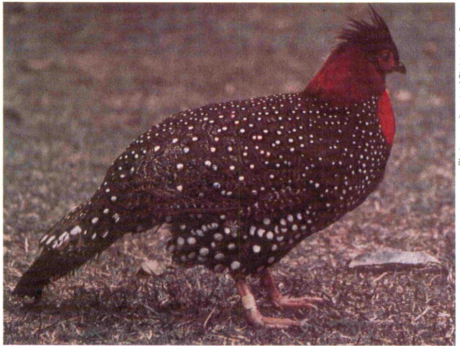
The endangered Western Tragopan (Tragopan melanocephala).

Of the five species of tragopans found in Asia, the Western Tragopan, Tragopan melanocephalus , has the westernmost distribution. In the past, Western Tragopans ranged from Swat in Pakistan to Garhwal in India but were generally considered rare and localized in distribution. Due to a decline within the last century, the species has been given endangered status. Reasons for this decline include destruction of habitat by humans and livestock, egg collecting, hunting for food, and trapping by local villagers. The total world population in 1982 has been estimated at 5,000 birds.