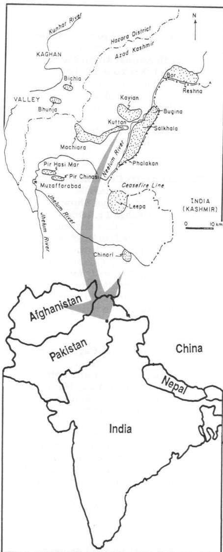
Known and reported distribution of the Western Tragopan in Pakistan.

India. Further observation of the tragopan population in the Neelum Valley documented that the species prefers short shrubs and trees and avoided the taller vegetation.