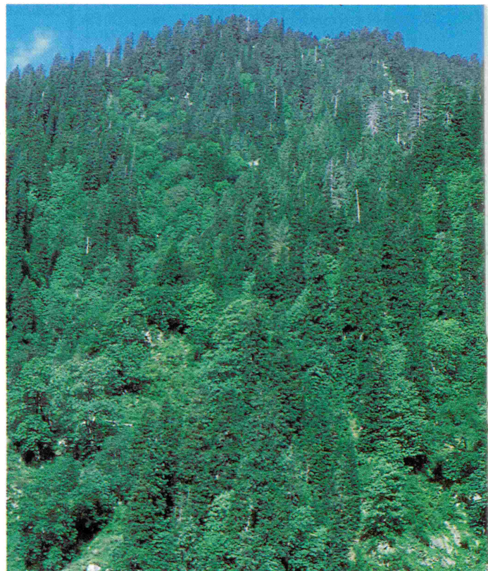
Habitat preferred (short conifers and small shrubs) by the Western Tragopan in northeastern Pakistan.