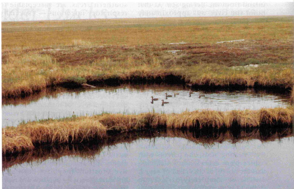
The tundra with its many lakes and ponds — home of the Spectacled Eider Duck.

During our expedition ours was the good fortune to enjoy unusually good weather — bright, sunny days with gentle breezes. One cannot depend upon nature to be so generous in the far north, and it was necessary to be prepared for difficult conditions at any time. We did, however, have one interesting involvement. To reach our final destination, we enlisted the aid of a flying service in Bethel which flew us the 100-plus miles to our campsite on the bank of the Aphrewm River. It was arranged that if weather remained favorable the flying service would return for us in ten days — sooner if difficult weather should prevail. As it developed, the weather remained perfect, necessitating no need for an early return. Chartering by light aircraft means that only necessary gear is taken. Everything was carefully planned, including each day's food supply. Our provisions were programmed for a ten day time period. On the tenth day our charter did not return as scheduled, nor did they come on the eleventh day. At that time our food supply was largely exhausted. By rigging a makeshift net we were fortunate enough to catch one of the salmon running upstream to spawn. By the twelfth day we were preparing to take 3/4 incubated eggs from nesting birds to sustain us . . . we were indeed becoming desperate. Fortun-