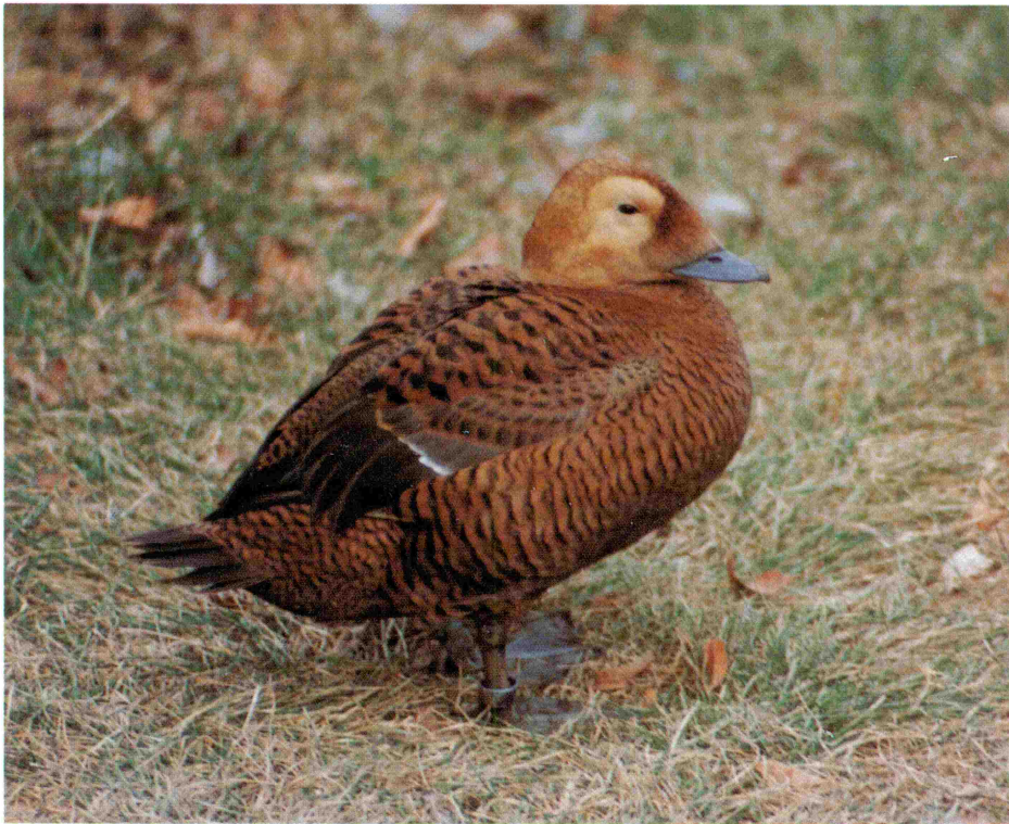
Adult female Eider.