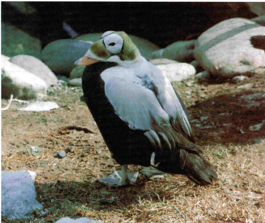
Adult male Eider.

were forgotten completely. Needless to say, they came post haste to rescue us. Understandably we were hungry, more than a little concerned, and I have often speculated upon what might have happened had it not been for the unlikely chance of that boatload of Eskimos happening by!