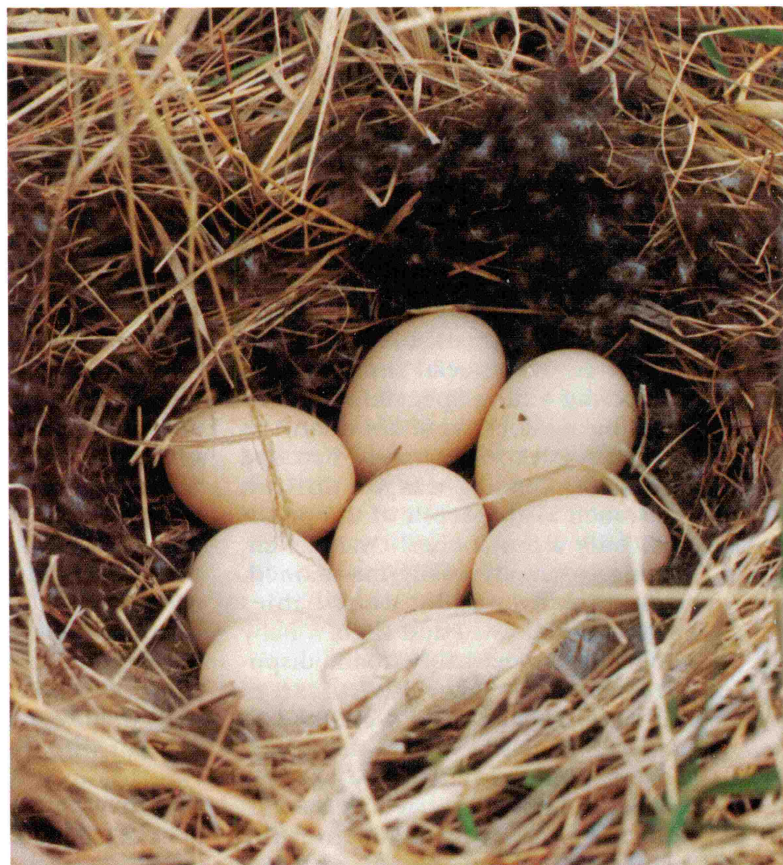
Eider nest lined with the famous Eider down.