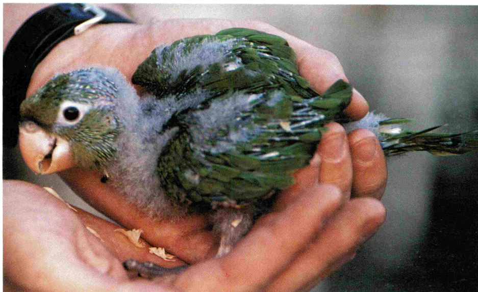
A young White-eyed Conure does not yet show the red cheek coloration of the adults.

to me to be a male, so I purchased it with very high hopes. I immediately had the White-eyed Conure surgically sexed and found indeed he was a male. The male was in good health and after about a month the two were placed together for breeding. During the male's routine quarantine on my property, I separated the hen from her long time temporary partner to make the introduction easier with the new male. This way, after the month of being alone she would welcome a new mate, and it worked; she did.