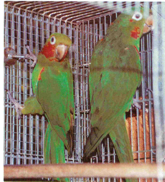
This pair of rare subspecies of the White-eyed Conure, Aratinga leucophthalmus callogenys , show red cheek patches compared to complete green heads of their near relatives.