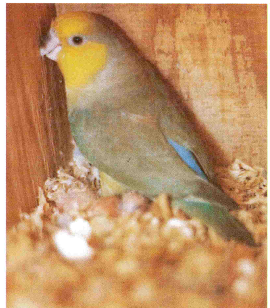
Yellow-faced parrotlet hen with newly hatched chick.

hatched on 3/17 and the next two on 3/18. The rest hatched on 3/21, 3/23 and the last one on 3/25. The seventh egg was clear. Incubation appears to be 21 to 22 days.