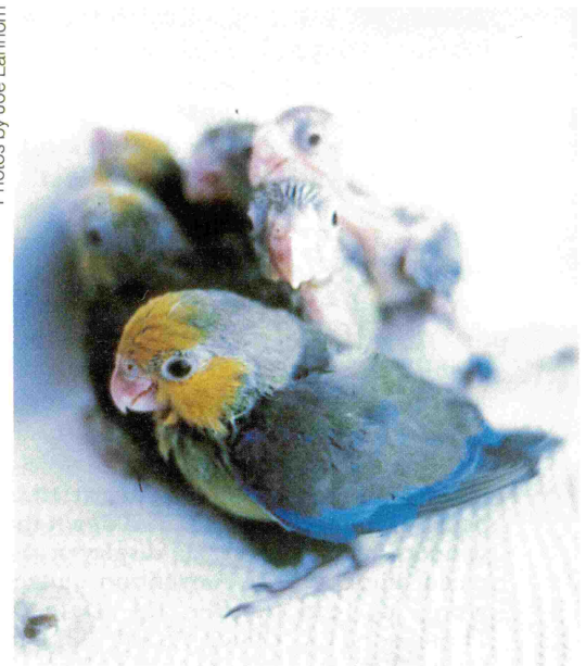
Our first clutch of six yellow-faced parrotlets.