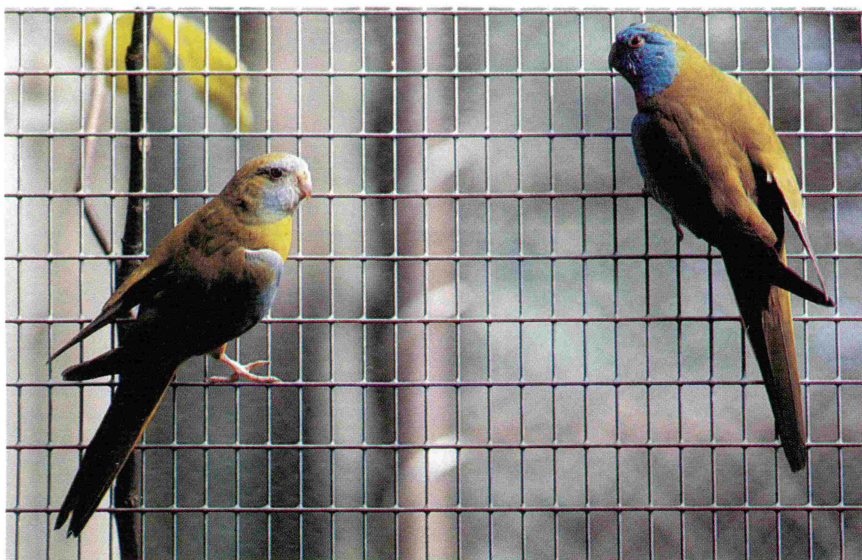
The cinnamon mutation of the Scarlet-chested Parakeet is one of the uncommon mutations found in captivity.