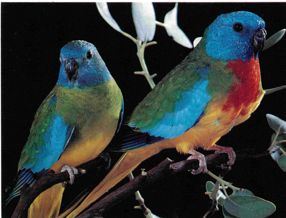
Scarlet-chested Parakeets, pair, they are one of the most colorful of the Neophemas, and they are an endangered species.