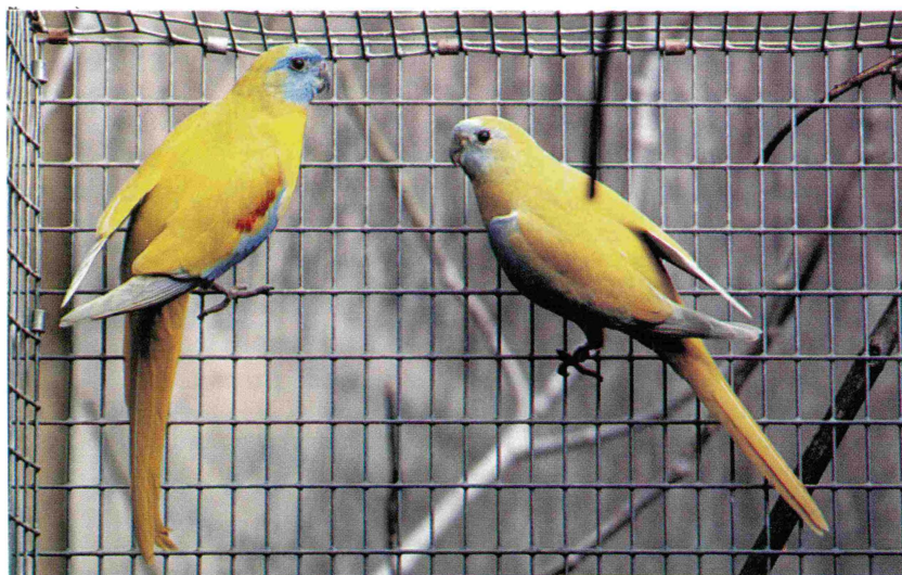
The yellow mutation of the Turquoise Parakeet is one of the most beautiful mutations found in the parrot world. It is a recessive mutation.