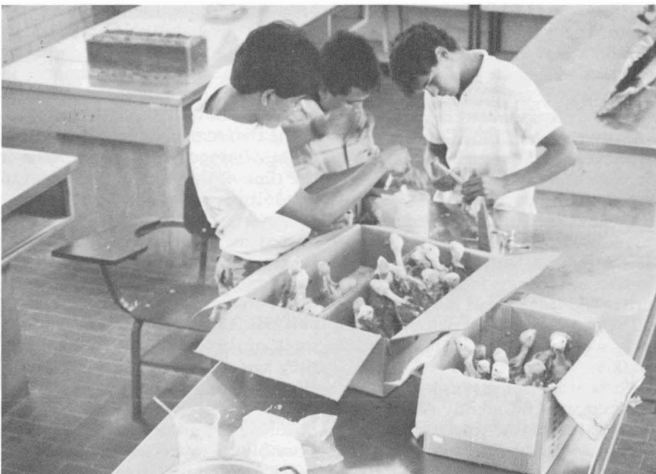
Confiscated Amazon chicks being hand fed by students at UAT.