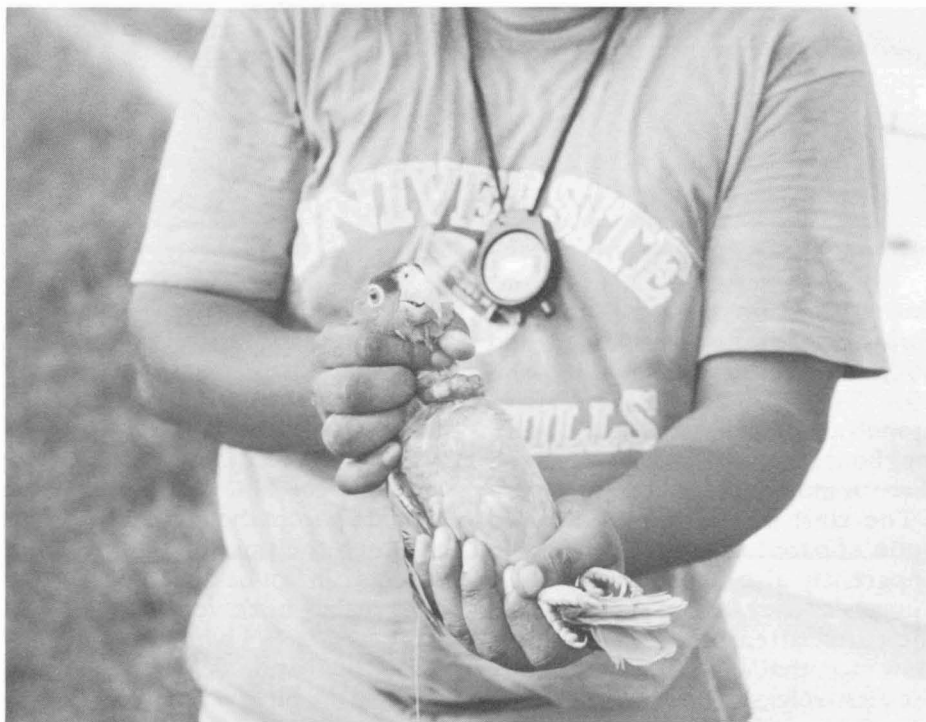
Mario Vazques holds parrot fitted with a radio antennae collar. This bird is being placed in the field enclosure and scheduled for release in the near future.

away from human habitation to reduce exposure to predators attracted to garbage and domestic animals. This should also reduce the problem of bonding with humans. A visual barrier was used so they could not see their keeper. Due to increased availability and information, natural food items were increased in kind, frequency and amount. Ripe coma berries became their first choice. Two of the radio transmitters for this release were twice as powerful to overcome tracking difficulties