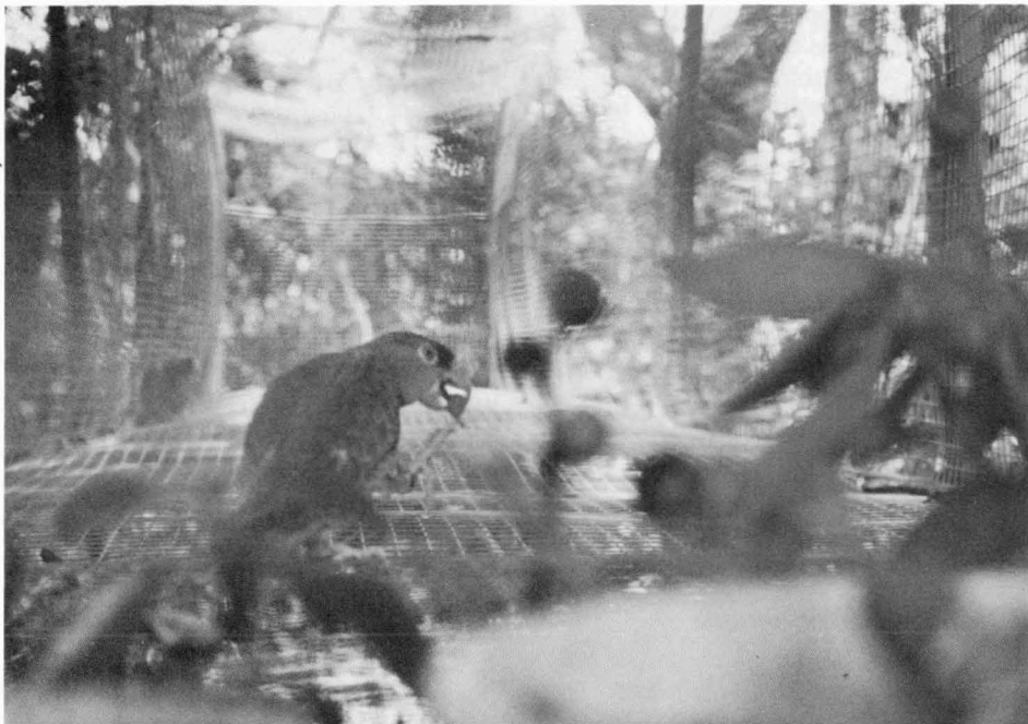
Green-cheek in field enclosure feeding upon native Coma berry.

during the first release. The birds consisted of two males, No. 264 and 064, and two females, No. 385 and 193. The No. 264 was another bronco and 064 was a hand fed yearling. Both females were hand fed and three or more years of age.