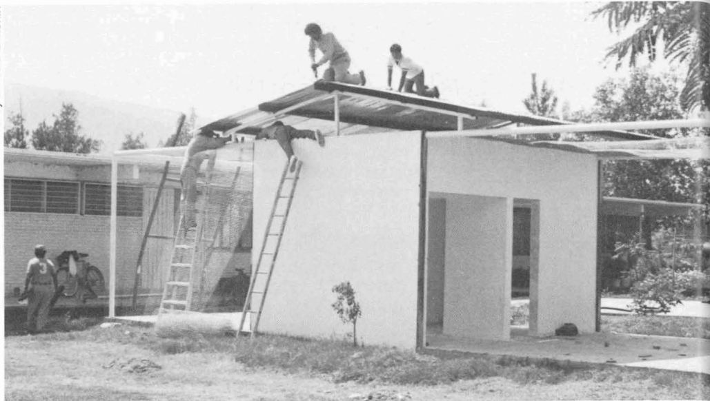
Workers constructing parrot rehab. facility on UAT campus, Ciudad Victoria, Mexico.