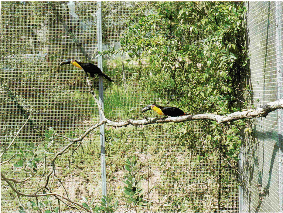
Breeding pair of Ariel Toucans at the author's breeding facility. The male of this pair is seventeen years old.