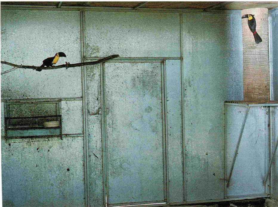
The back side of the spacious aviary is a solid wall as are the side panels. The permanent roof provides additional protection. This pair makes good use of their palm log nest.

more in private hands, but no information exists on their whereabouts. Those that are kept as pets should be placed in breeding situations for the sake of the gene pool.