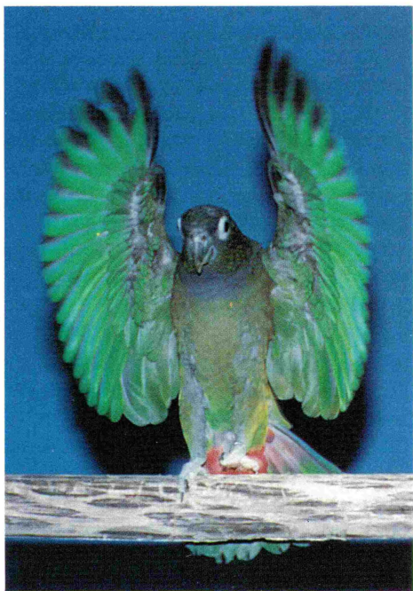
One of nature's well designed flying machines . . . a Maximillian Pionus shows off his beautiful flight feathers.