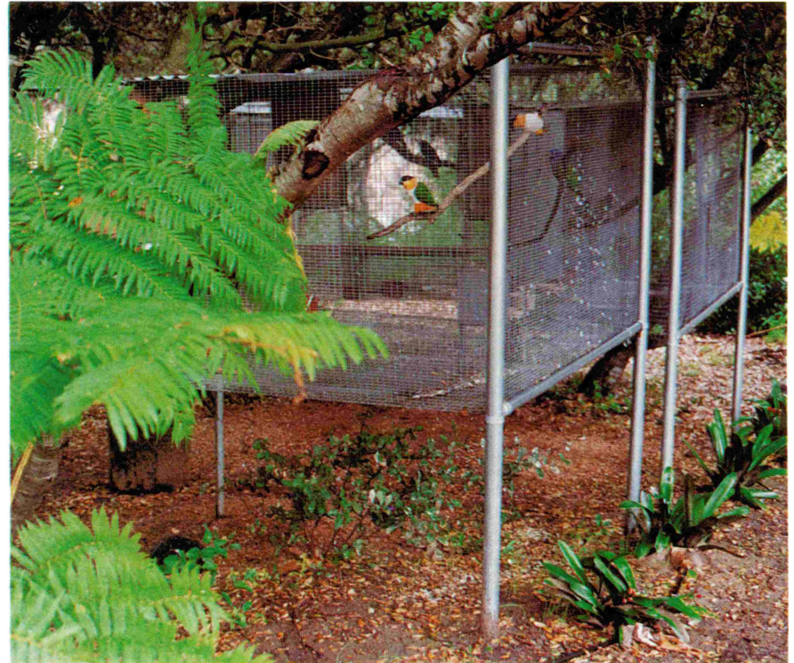
This pair of Black-headed Caiques still have a jungle environment but don't have to worry about predators or working for a living.