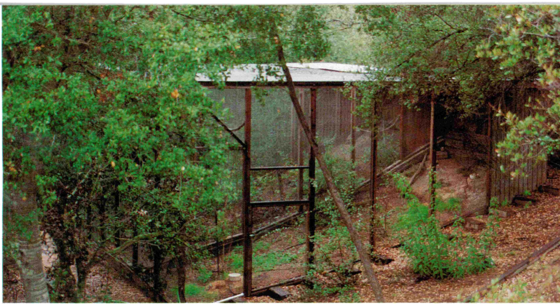
This enclosure is built on a dirt hillside for a reason. The resident Blue-crowned Mot Mot's are burrowing birds and find this habitat very much to their liking. They dig like a pair of miners.