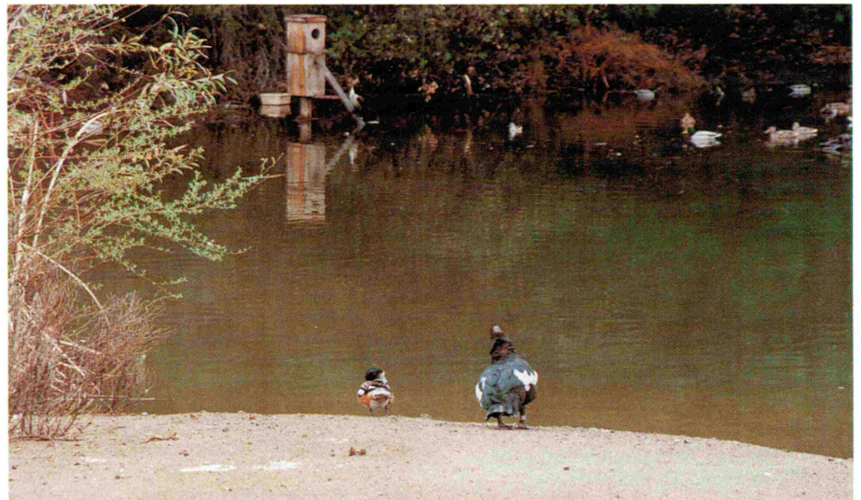
There is a wide variety of waterfowl on the pond, many of them quite rare and beautiful. The pond affords a much appreciated sanctuary for such visitors as Blue Heron—much to the annoyance of the fish.