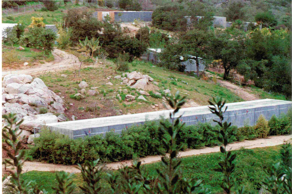
From the hilltop where the house is, one can look down into the valley and see some of the banks of aviaries. The long bank in the foreground is full of macaws but their noise is not the least bother at the house.