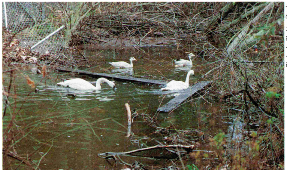
In this remote corner of a huge pond, the Whooping Swans and Bar-headed Geese feel right at home.