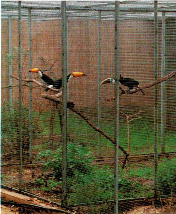
The Toco Toucans are always curious and alert. Their next door neighbor is a Red-billed Toucan — a species for which Jennings received a World First Breeding award.