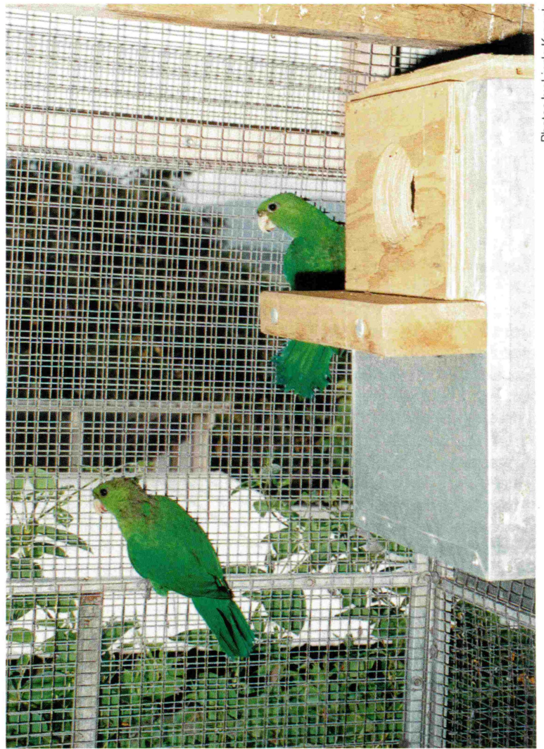
The Purple-bellies nested in boxes that were approximately the same size as a deep cockatiel box, 10" x 10" x 20", constructed of metal and fully lined with wood.

Five Purple-belly chicks were successfully raised in 1992. Shown here shortly after weaning at about ten weeks old. Purple-bellies are particularly fond of strawberries, apples, oranges, grapes, green beans and corn.