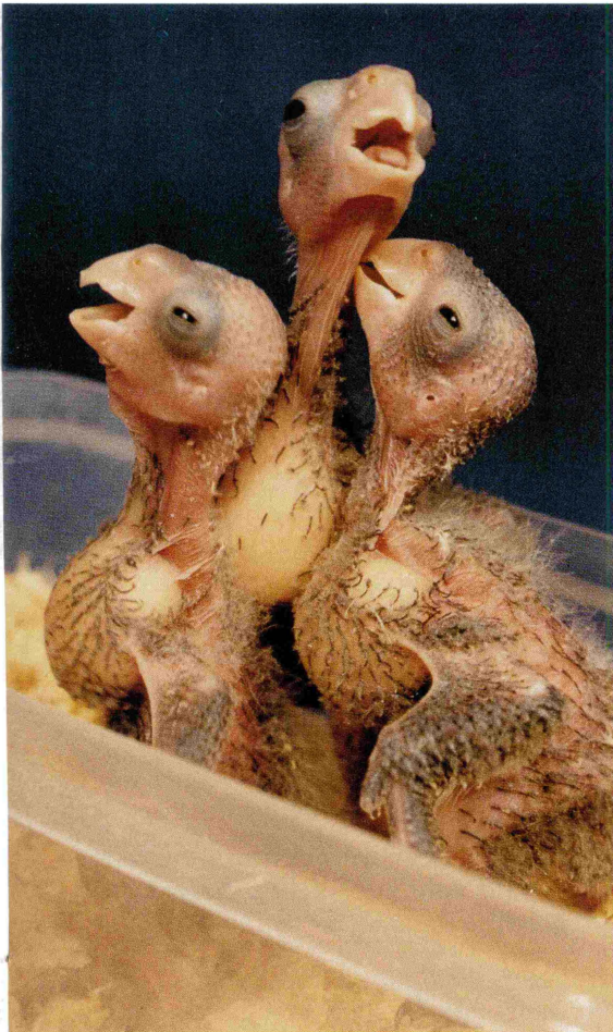
The babies' eyes opened at about 21 days old.