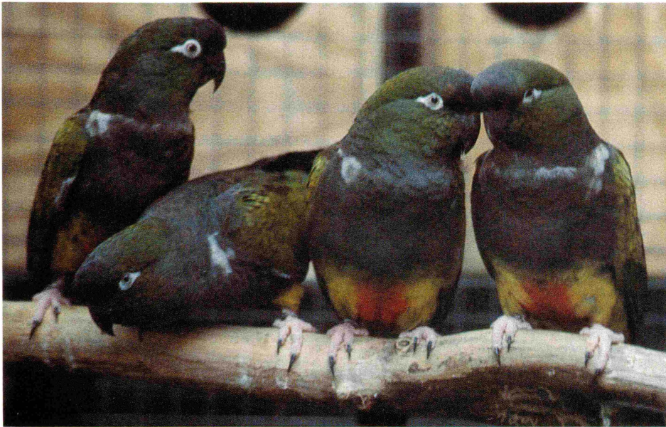
Patagonian Conures do not belong to the Aratinga genus. They are separated within their own genus. A very large conure, the Patagonian is an excellent choice for both the aviculturist and the pet owner.