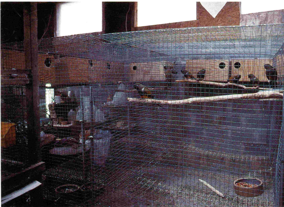
This photo shows a successful colony of breeding Patagonian Conures. Note the height and conformation of the nest boxes.

nights when the moon is nearly full, they are very active and fairly noisy. None of the other conures seem to have this habit. Recently I began to leave the aviary dimly lit at night, and have heard the Patagonians feeding their babies far into the night. All of our pairs spend a lot of time in their boxes. The wild-caught pairs hide their heads in a corner while I am checking their boxes, whereas Diabolo and Victoria, who were handreared, attack us. They will both back up to the far end of the box and charge. Last year this resulted in broken eggs.