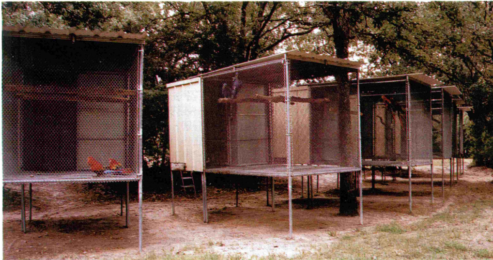
The standard breeding cage design at the Macaw Project is called the "condo," short for condominium. The suspended cages are of galvanized steel and 1", 10-gauge chain link wire construction measuring 6 ft. tall, 12 ft. long and 6 ft. wide. The back 4 ft. is covered by exterior metal shelter area and the entire cage is roofed. Inside the cage, an "L" shaped aluminum partition and Dutch doors are used to subdivide a safety-cage entry area at the back of the structure.