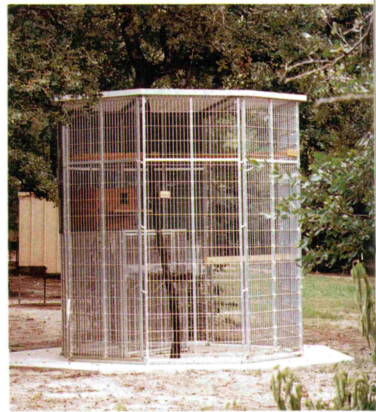
One of Dr. Gallaway's companies (IGL Animal Care Products, Inc.) manufactures cages for zoos and the primate research industry. Shown here is a Rhesus Monkey cage design which also serves well as a breeding cage for Hyacinth Macaws. The cage, called the penthouse, is 12 ft. tall with an octagon floor plan. Construction material is a research-grade aluminum alloy.