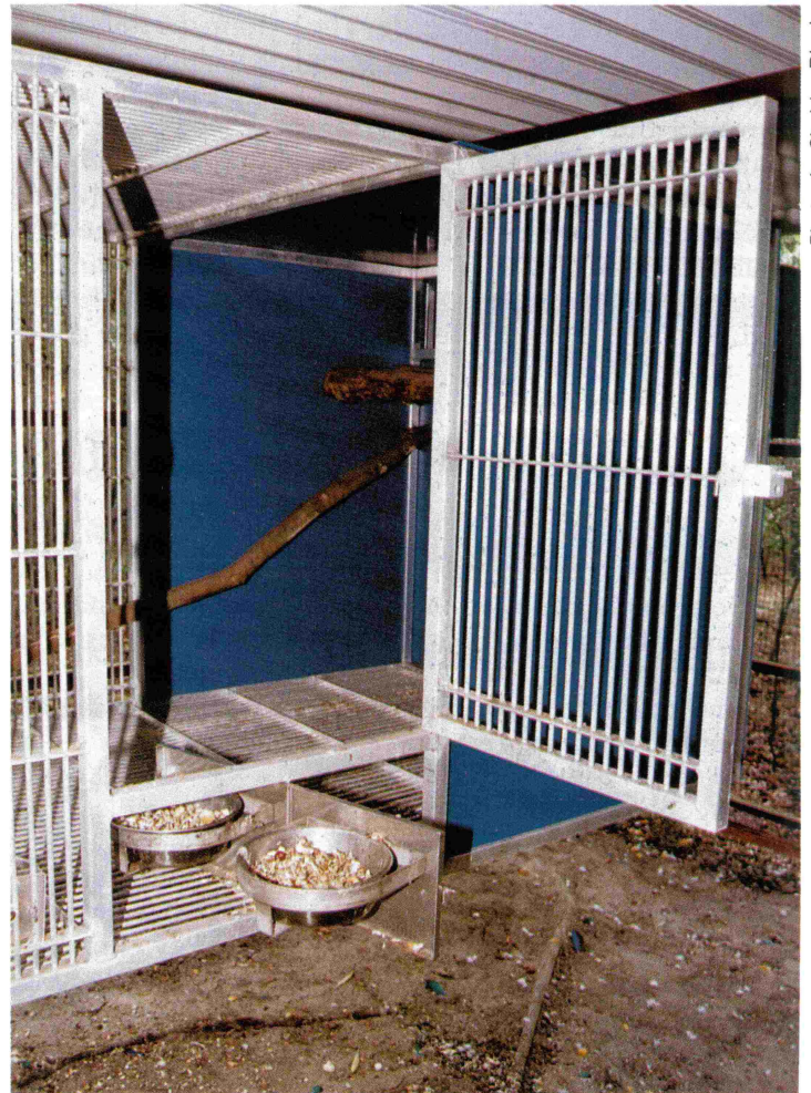
Entry and feeding doors of the "apartment" cages in Flight D. The swivel feeding door enables protection to the caretaker.