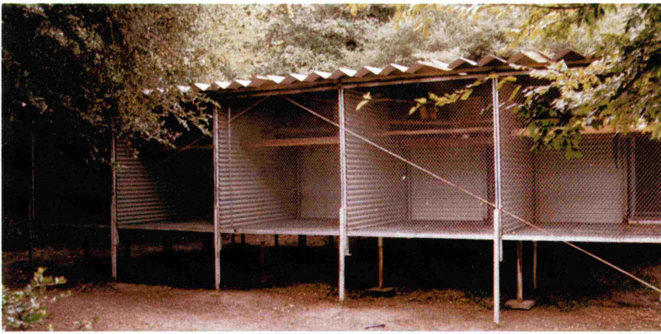
Individual cage units of Flight C measure 6 ft. wide x 6 ft. tall x 8 ft. long. Metal panels provide visual separation from other pairs. Nest boxes are suspended inside the cage at the back corner.