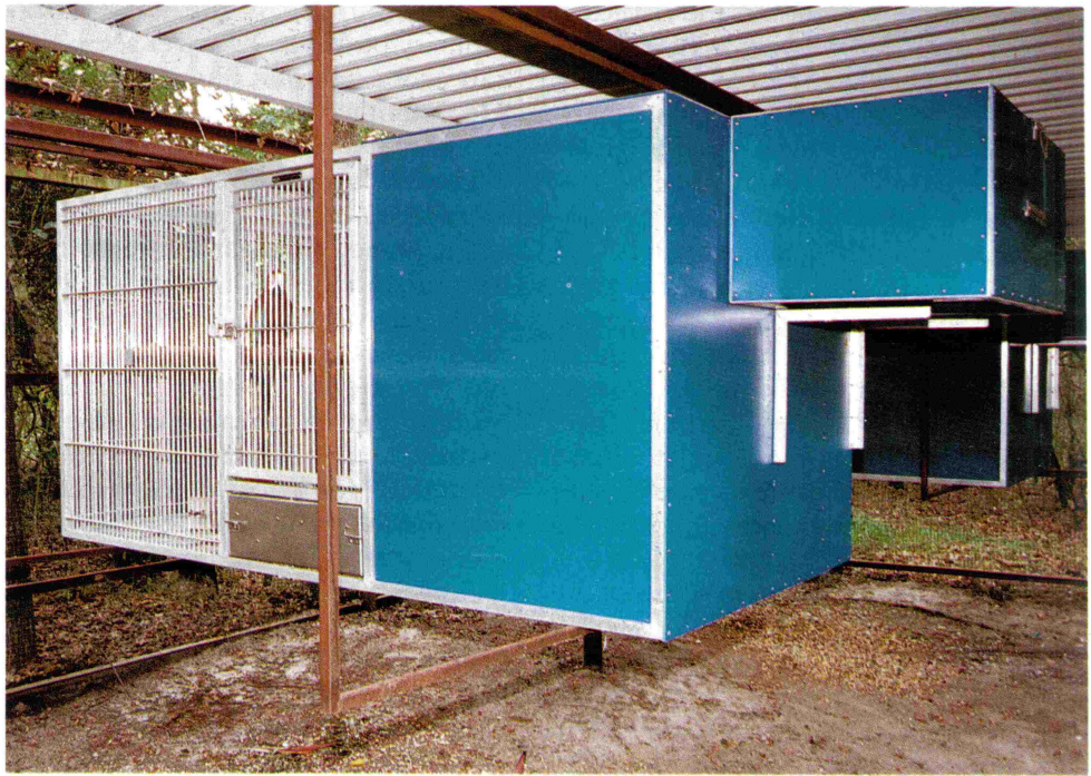
Flight "D" at the Macaw Project houses three suspended "apartment" cages designed to house the intermediate-sized Red-fronted Macaws. At present, they are being used to house young, bonded pairs of large macaws awaiting construction of new condos. These cages are 4 ft. wide x 8 ft. long x 4 ft. tall and are of aluminum rod and polypropylene plastic construction. Entry and feeding doors are on the side with a nest box attached to the back.