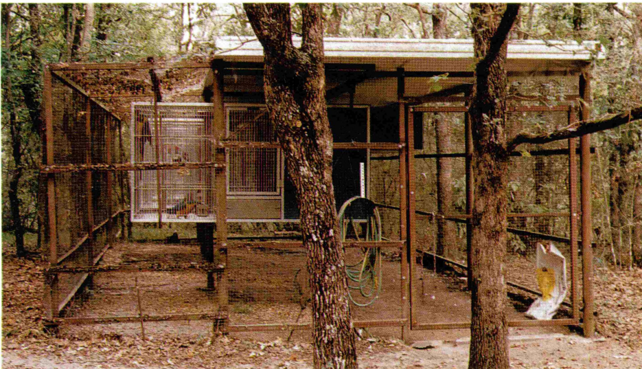
Flight "D" is of steel and wire-mesh construction, partially covered by an awning roof. The flight is located in a secluded area to be used for shy pairs such as the Red-fronted and Caninde Macaws.