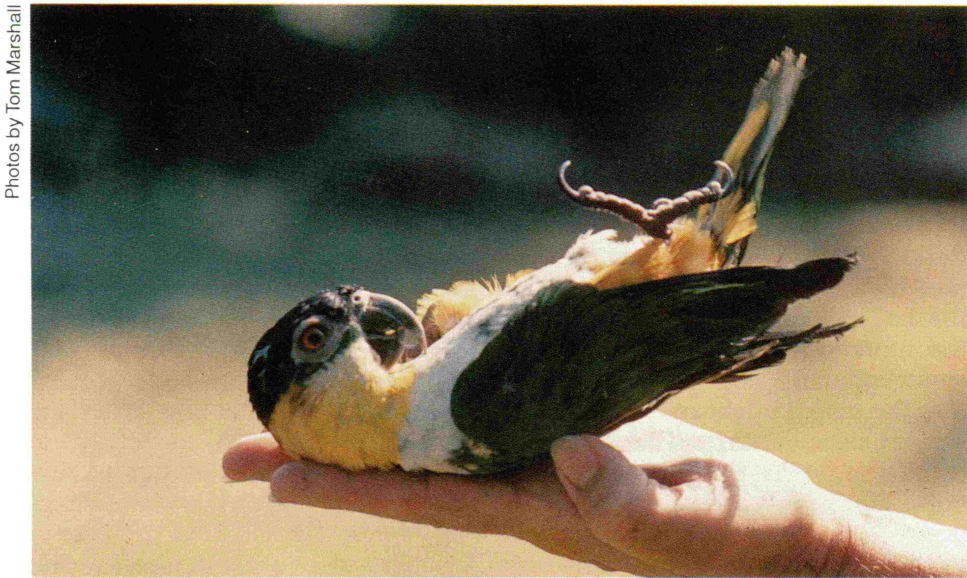
Handfed youngsters make very good pets and are trainable, but, if they are not handled consistently, can be quite headstrong when they mature.

Like lories, caiques really enjoy eating fruit. Many successful breeders will provide them with nectar mixes, which they seem to relish. Unlike lories, however, caiques are extremely poor flyers. This factor certainly could contribute to isolating population pockets of caiques thereby allowing for the evolution of specific color variations, which have proven adaptive to particular environmental pressures. Their attempts at flying give the impression that it is a somewhat difficult activity and the execution