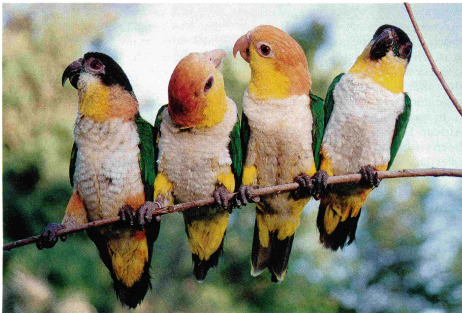
Both the Black-headed and the White-bellied Caiques are very captivating as juveniles. Excluding the total white cockatoos, the caiques are the only parrots that have white breasts.