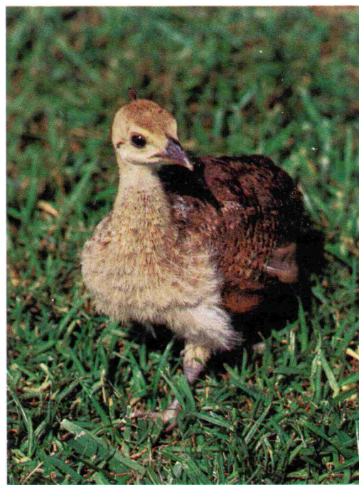
Young peafowl show the beginnings of the crest found on the adults.