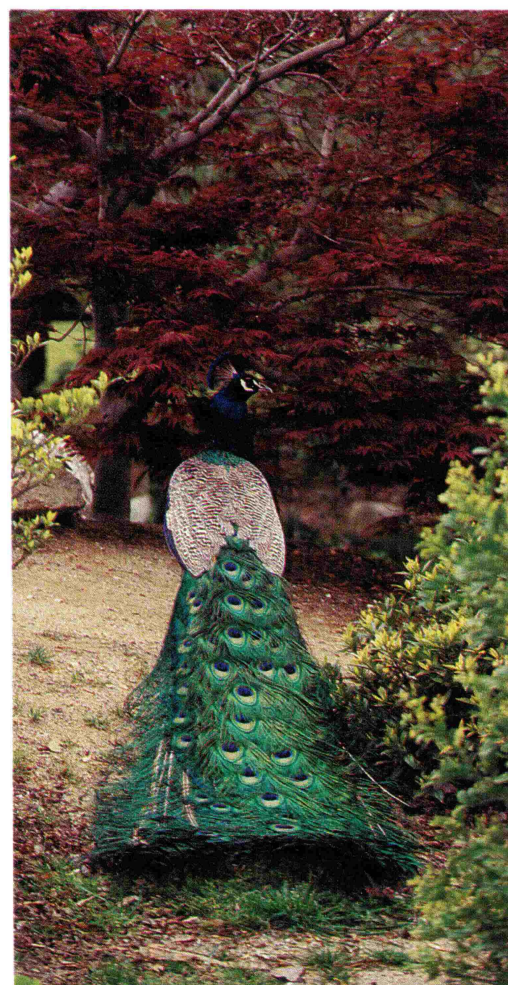
The male peacock uses his six-foot train or tail during courtship. When spread, it appears as a shimmering fan with iridescent "eye" markings.