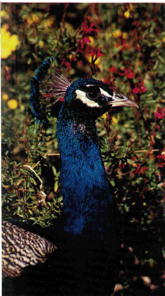
Peafowl belong to the pheasant family with the adult males being brilliantly colored.