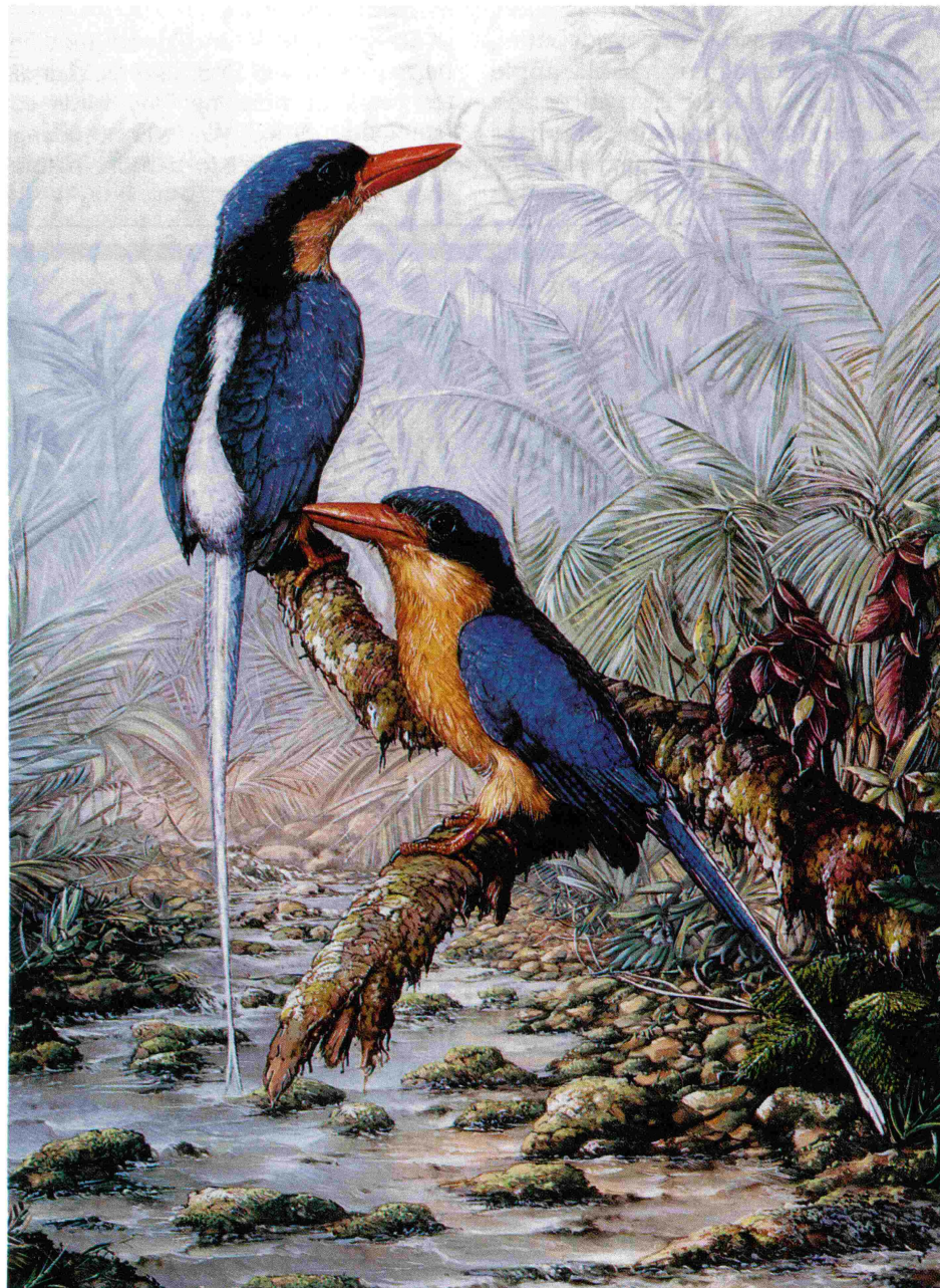
White-tailed Kingfisher ( Tanyiptera sylvia )