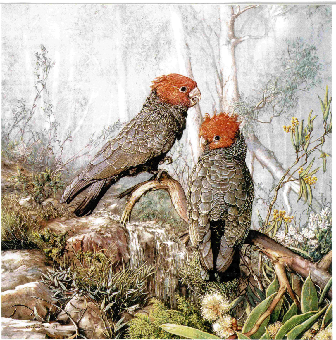
Gang-gang Cockatoos ( Callocephalon fimbriatum )