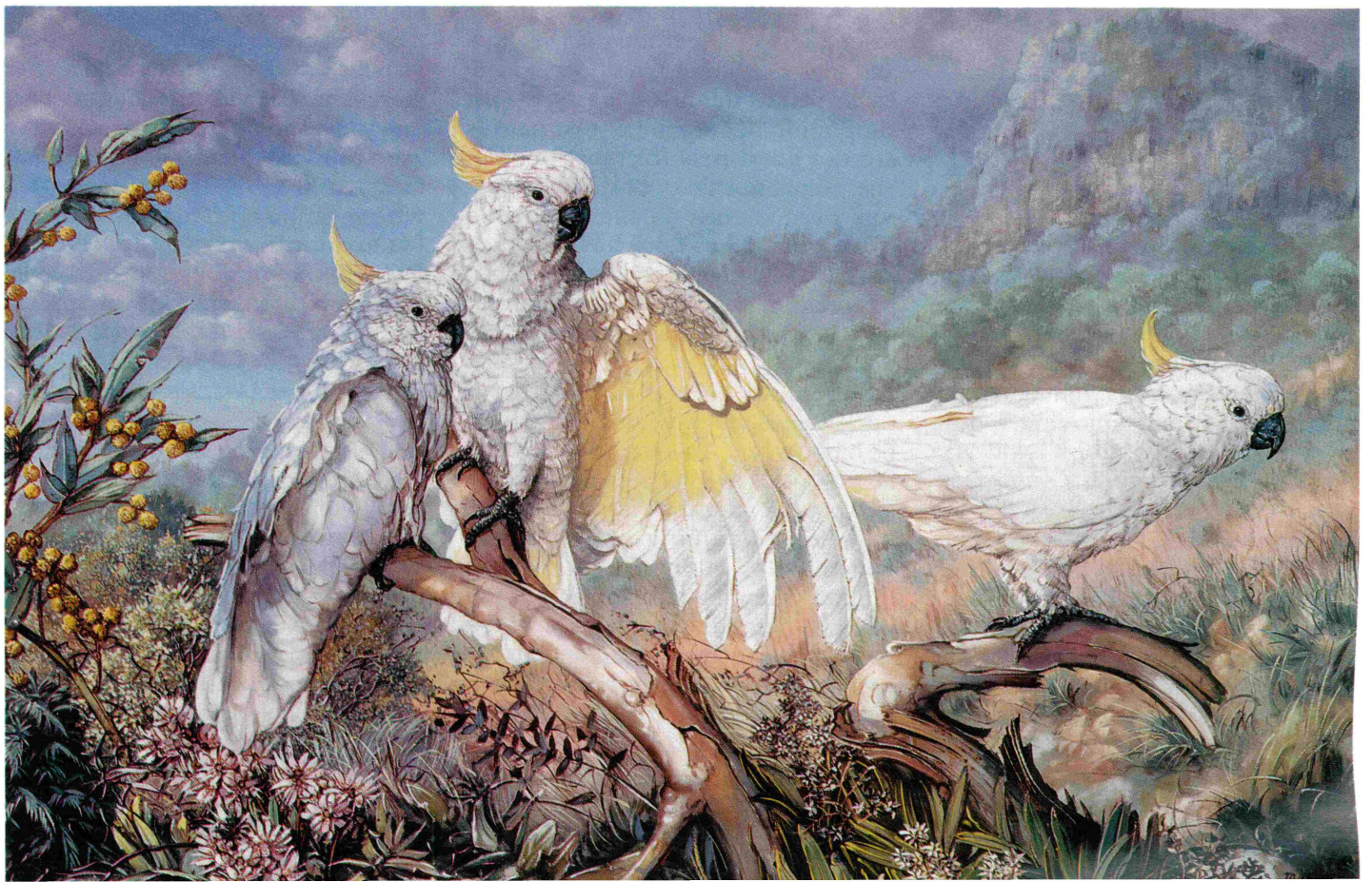
Sulphur-crested Cockatoos ( Cacatua galerita )