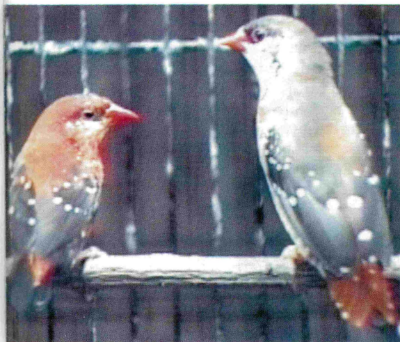
Timor Strawberry cock on left, A. a. flavidiventris, and out-of-color nominate subspecies cock on right, A. a. amandava. Notice the larger body size, proportionately larger white dots, and smaller beak of the nominate than the Timor Strawberry.