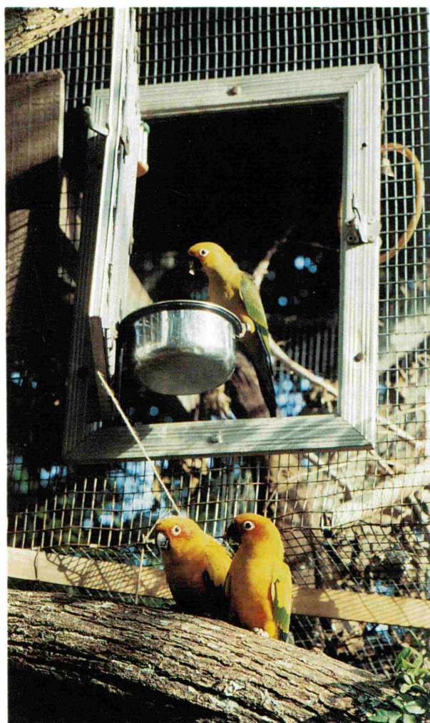
Kiwani and Kaya relax in the sun on a favorite perch as baby Kiku fills up on food from the swing out feeding cup on the open door.

Two of the three healthy baby Sun Conures were pulled at approximately 28 days of age leaving only Kiku to be raised by her parents. The wood shavings shown here are near perfect chips and spirals made by the mother and father from the inside of the nesting log.