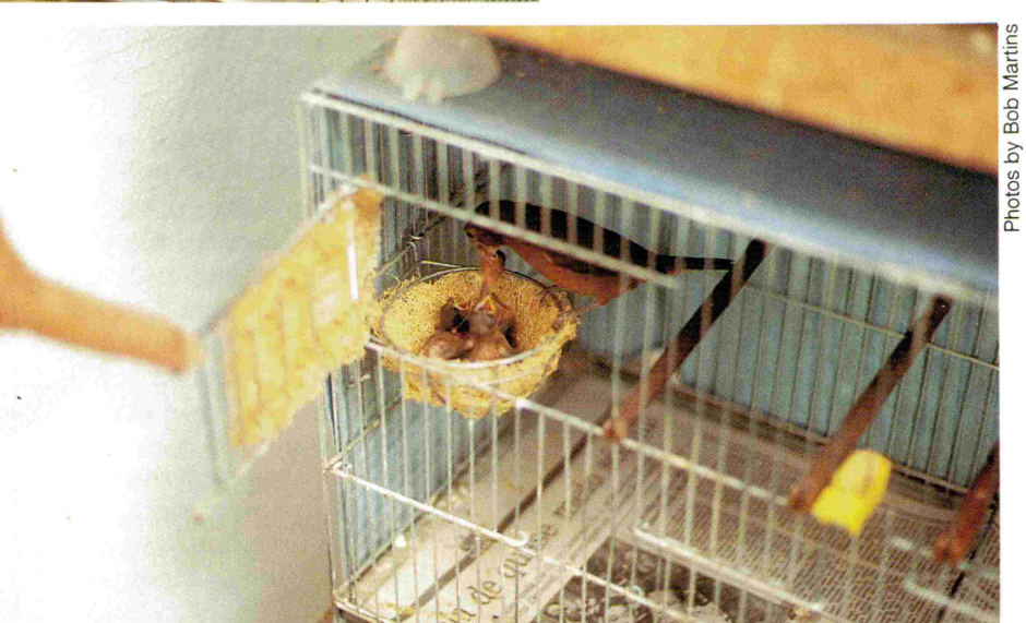
A Bicudo hen feeding her young.