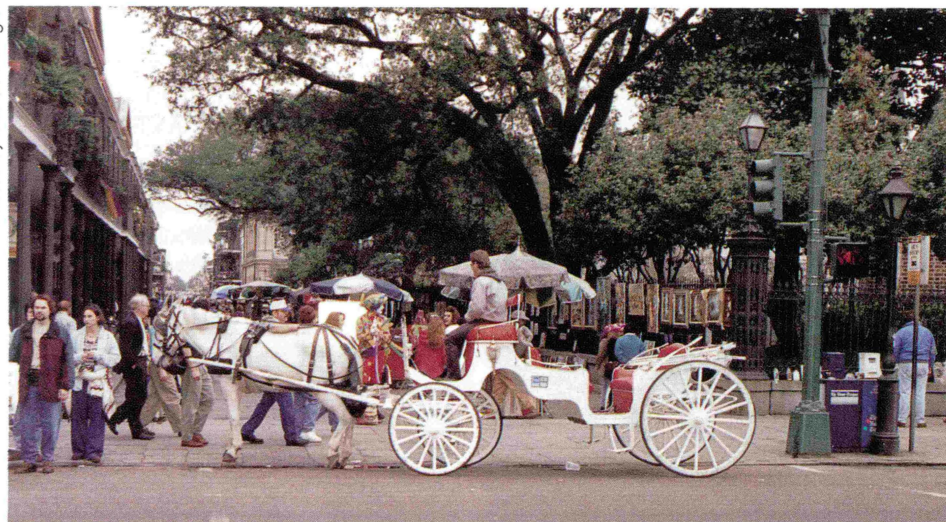
Ye olde horse and carriage. This is transport the old fashioned way but it's a lot of fun. It is a pleasant way to see the sights.

When New Orleans was founded in 1718, Creoles were cosmopolitan, city dwellers and Cajuns were the rustic, self-sufficient country dwellers. The Cajuns lived close to the land, amid the bayous and the swamps, happily removed from city life. They were hunters and trappers, farmers and fishermen who worked hard during the week and enjoyed their weekends! "Laissez Les Bon Temps Rouler" (Let the Good Times Roll) has always been part of their philosophy. They proudly retained their customs, religion and their own form of the French language, "Patois" (pat-wa). Patois has been passed down orally for three centuries dating back to Brittany and Normandy. Cajun French has almost disappeared but their distinctively accented English and Cajun idioms prevail, as do their music, food and customs. ➔